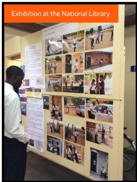
Exhibition at the National Library