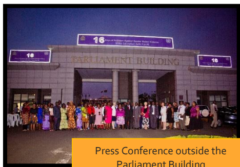
Press Conference outside the Parliament Building

The UN held a press conference and a ceremonious lighting of the Parliament Building in the capital, Lilongwe. The building was lit in purple lights to raise awareness of the campaign. These lights stayed on throughout the 16 days of Activism against Gender Based Violence. The Parliament was chosen for the light up to serve as