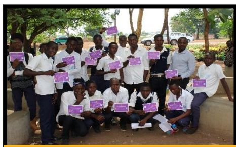
Students of Athens Secondary School Display Signed HeforShe Pledge Commitment Cards

In light of this UAAG performed a two hour concert, on the 11 th of December 2015, in commemoration of the 16 Days. An estimated 70 people attended from different walks of life. The show was also broadcasted on Zodiak Radio Station and