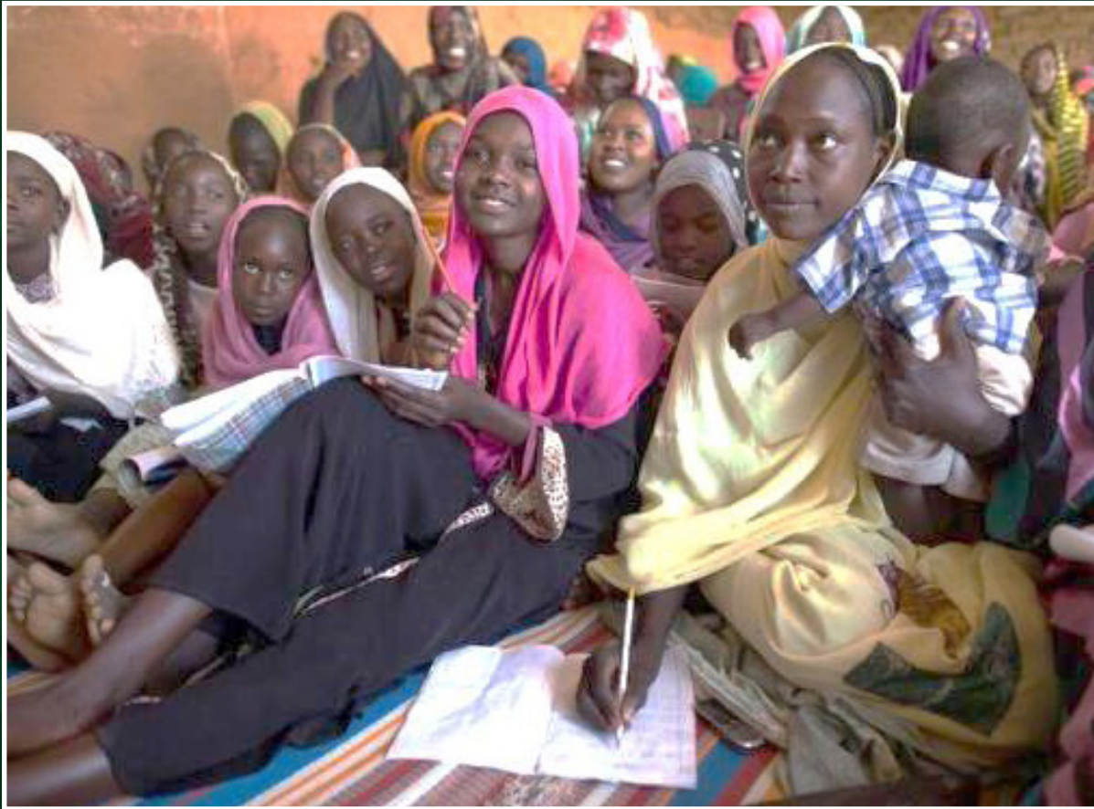
Women in Abu Shouk Camp for internally displaced persons (IDPs) near El Fasher, North Darfur, attend English classes conducted by volunteer teachers and facilitated by the police component of the African Union-United Nations Hybrid Operation in Darfur (UNAMID), 18 February 2014.