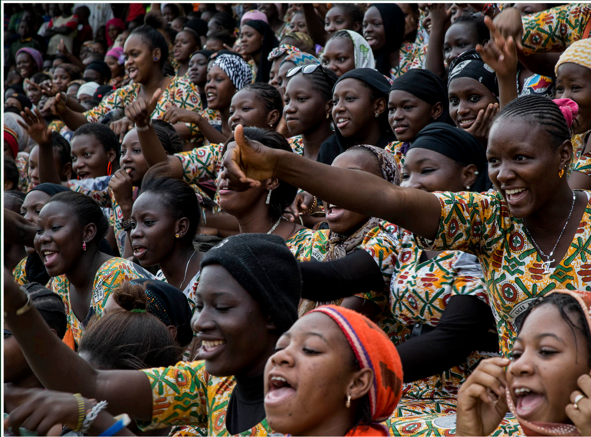
The youth and MINUSMA united for peace in Mali at an event organised by MINUSMA at Mamadou Konate Stadium, Bamako, Mali on 7 January 2016.