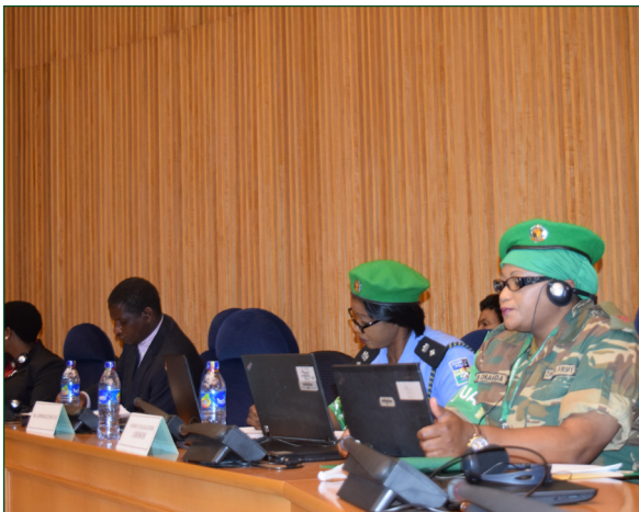
AMISOM Women Peacekeepers address the African Union Peace and Security Council on, "The role of women in protecting lives in challenging security environments in Africa" on 16 February, 2017.

Peacekeeping has evolved over time, and has become multidimensional and complex. Peacekeepers now include not just military personnel, but also people who can help build new state institutions – for example judiciary and police which incorporates former rebels – as well as human rights monitors, economists, electoral observers, de-miners, legal experts and humanitarian workers.. To this end, peacekeeping is no longer concerned about the peacekeeping force being a buffer between two warring factions, but now includes a focus on peacebuilding activities. When reporting on peacekeeping, it is important for gender-transformative media coverage not only to examine the activities that peacekeepers are undertaking to bring peace. It is equally important to spotlight the gender issues, especially the quantitative and qualitative representation of women in peace support operations and peacekeeping missions.