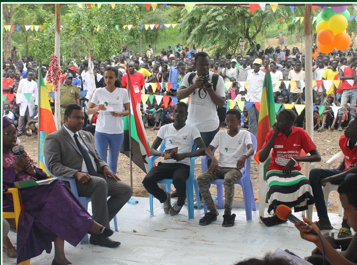
Day of the African Child; Inter-generational Dialogue at a Refugee Camp in Gambella, Ethiopia. Young people engaged with authorities on the theme, "Conflicts and crises in Africa: Protecting all children's rights", on 16 June, 2016.