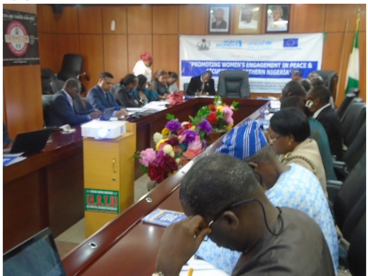
Cross Section of Stakeholders at the Programme Steering Committee Meeting in Abuja.

A National Programme Steering Committee (PSC) for WPS was inaugurated in July 2014. The committee was set up to provide strategic direction and overall guidance to the Programme. The PSC comprises of thirteen organisations which include government ministries, departments and agencies (MDAs), members of the UN Women Civil Society Advisory Group, civil society organisations (CSOs), security agencies, development partners, the European Union and UN Women.