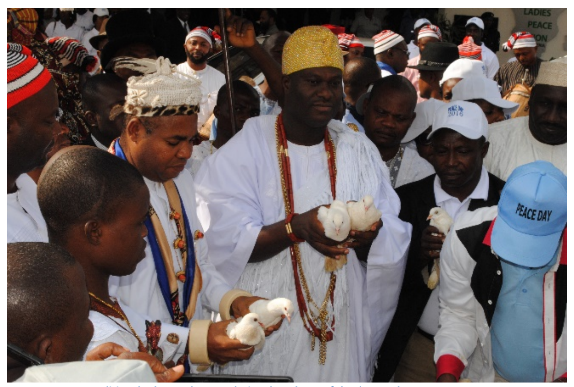
Traditional rulers and guests during the release of the doves.

decision making at all levels on issues of peace and security. UN Women through its European Union funded Programme on Women, Peace and Security is working on strengthening the engagement of women in peace and security in northern Nigeria. We see this as a key building block in attaining the Sustainable Development Goals". – Njeri Karuru