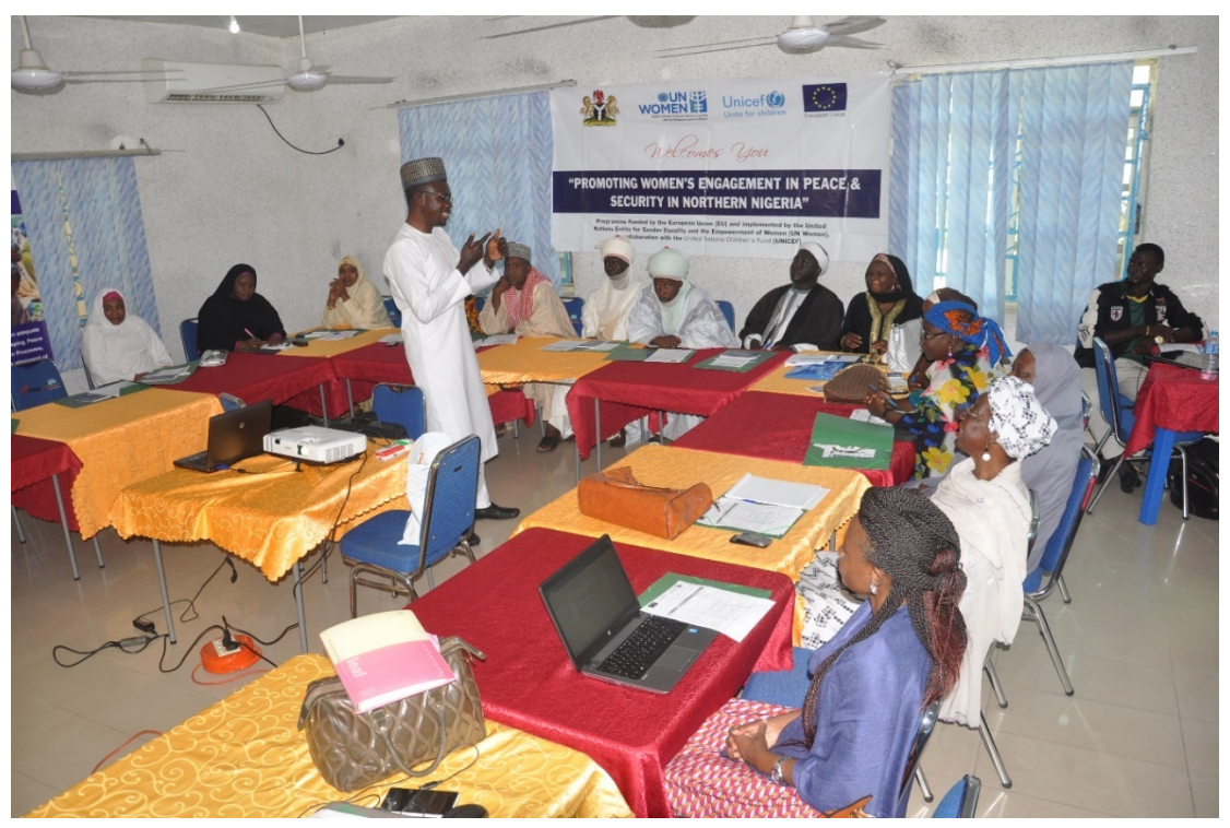
Cross-section of participants at the Capacity Building Workshop on Gender and Related Issues in Gombe State.