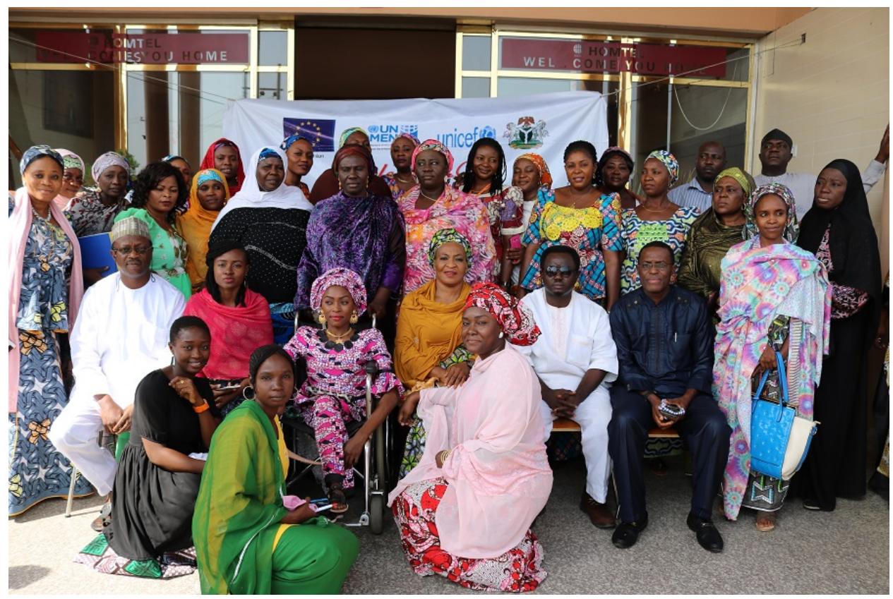
Cross-section of participants at the Capacity Building Workshop on Gender-Sensitive Reporting for female journalists in Adamawa State.

The Capacity Building Workshop was conducted in Plateau and Adamawa states to train female journalists on the UNSCR 1325, the Nigeria National Action Plan, gender sensitive reporting, and safety while reporting among other gender related issues. The participants comprised of both print and electronic media journalists from Abuja, Plateau, Bauchi, Gombe, Adamawa, Yobe and Borno states.