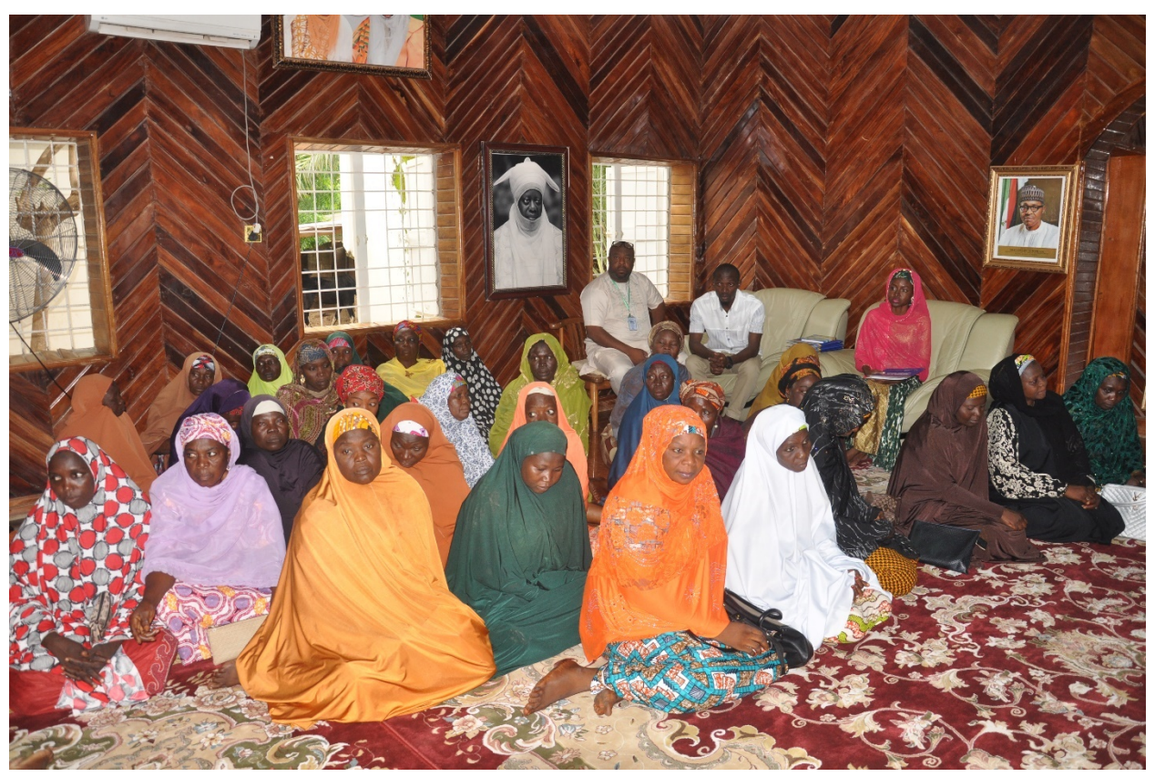
Female title holders and women in the Kaltungo community at the Emir of Kaltungo's Palace.

Kaltungo Kingdom presently has more than 40 women as traditional title holders. One of the female chiefs is also one of the women mentors selected under the Programme.