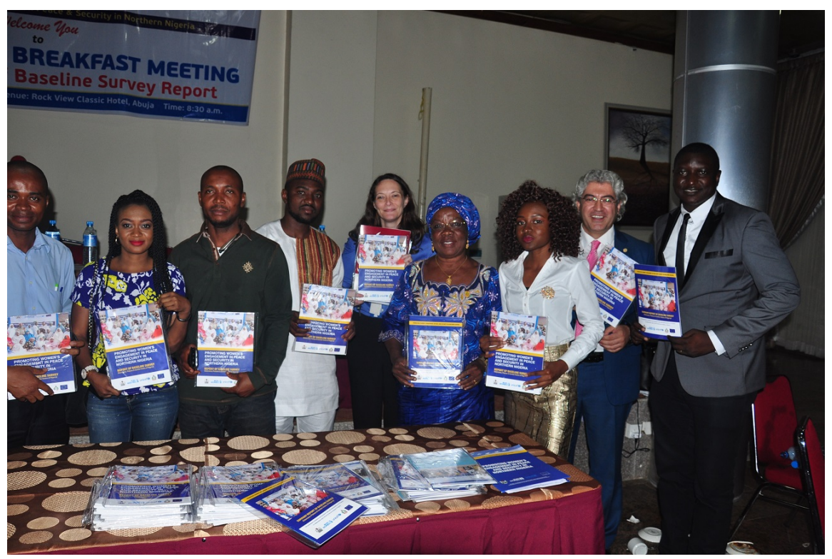
Members of the UN Women Media Network and other stakeholders at the launch of the Baseline Survey Report in Abuja.

Six State Coordinators for the Nigeria Association of Peace and Gender Practitioners in Media were nominated at the planning and review meeting and workplans were also developed for each state and presented to all participants. Suggestions on potential training topics for media practitioners by members of the Association were duly noted.