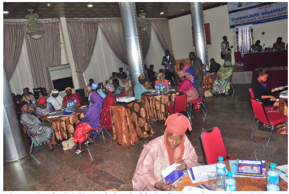
Cross section of stakeholders at the launch of the Baseline Survey Report.