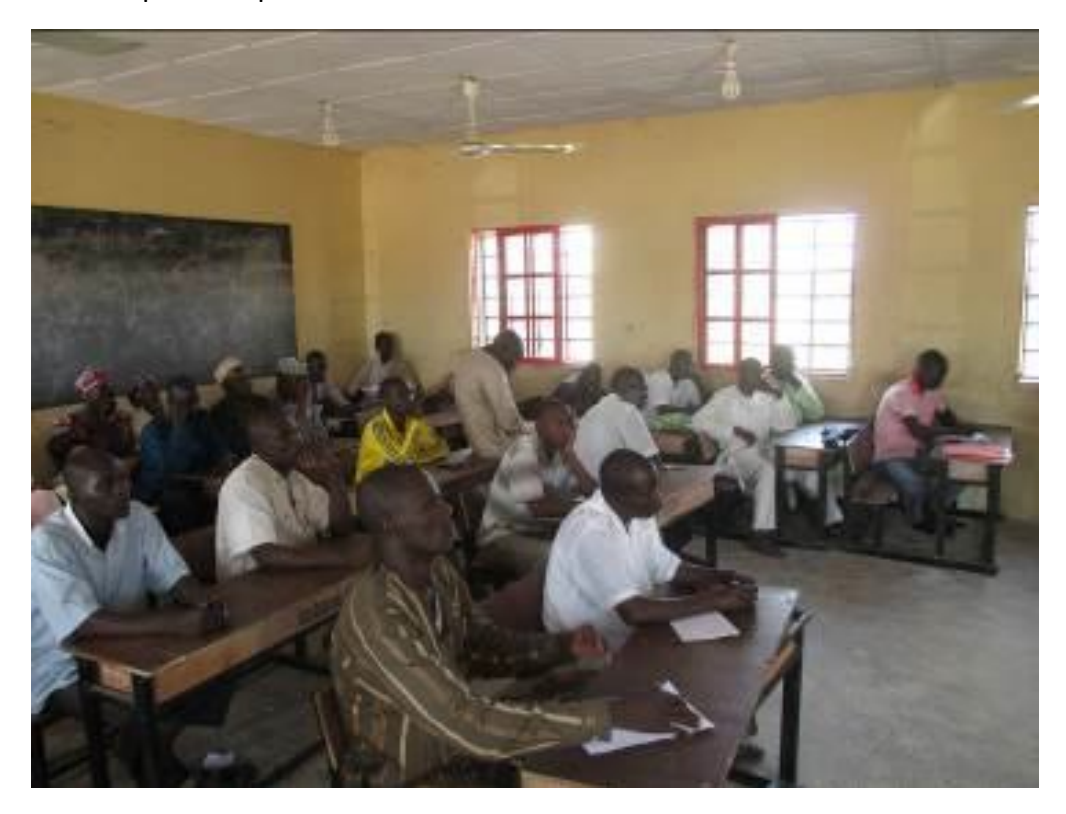
Cross section of participants during the training for the Community Based Child Protection Committee members.

Between May 2015 and January 2016, UNICEF partnered with the International Rescue Committee (IRC) to address the impact of conflict on children in Adamawa State and mitigate the risks of violence, abuse and exploitation for children who are separated from their families. One of the measures agreed upon was placing children with trained caregivers, an approach that continues to prove impactful.