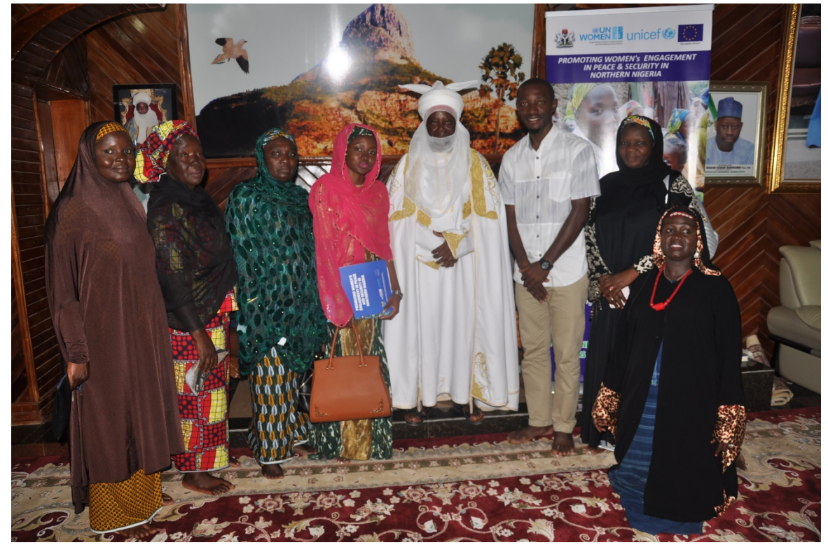
A few female title holders with the Emir of Kaltungo during a UN Women Media visit.

I have achieved a lot as an adviser to the Mai. The female title holders discuss freely with him and advise him on different issues that will bring positive change and development to Kaltungo.