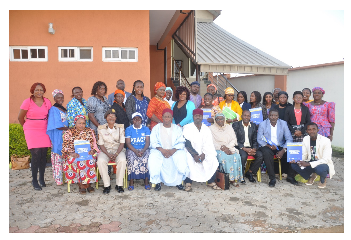
Group photograph of participants at the Stakeholders' Consultative and Review Meeting of the Plateau State Action Plan on UNSCR 1325 National Action Plan.