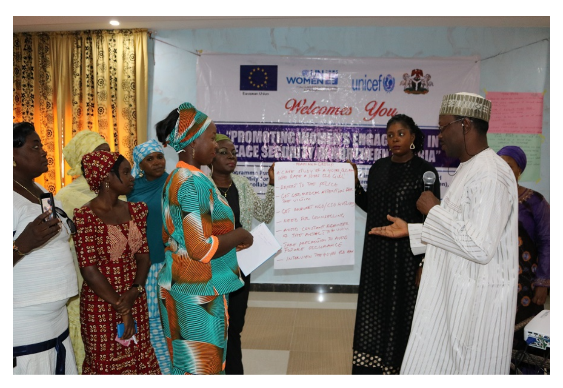
Interactive session at the Capacity Building Workshop on Gender-Sensitive Reporting for female journalists in Adamawa State.