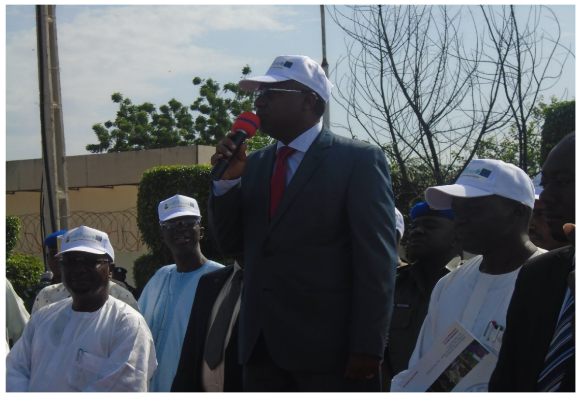
Gov. Umaru Jibrilla Bindow promising to maintain peace and empower more women in Adamawa state at the Commemoration of the International Day of Peace 2016 and Widows Day 2016.