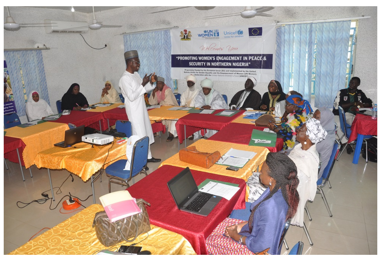
Cross-section of participants at the capacity building workshop in Gombe State.

The UN Women Northern Nigeria Women Peace and Security (WPS) Programme organised a three-day capacity building workshop on gender and related issues in collaboration with the Gombe State Ministry of Women Affairs and Social Development (MWASD) on 16-18 August. The workshop had 33 participants comprising traditional women rulers. mentors. representatives of the state MWASD, representatives of religious bodies, the Office of the Wife of the state governor, the state Ministry of Justice and the media. The focus of the workshop was to advance strategic advocacy on ending gender-based violence as well as the Gender and Equal Opportunities Bill (GEO) in Gombe State.