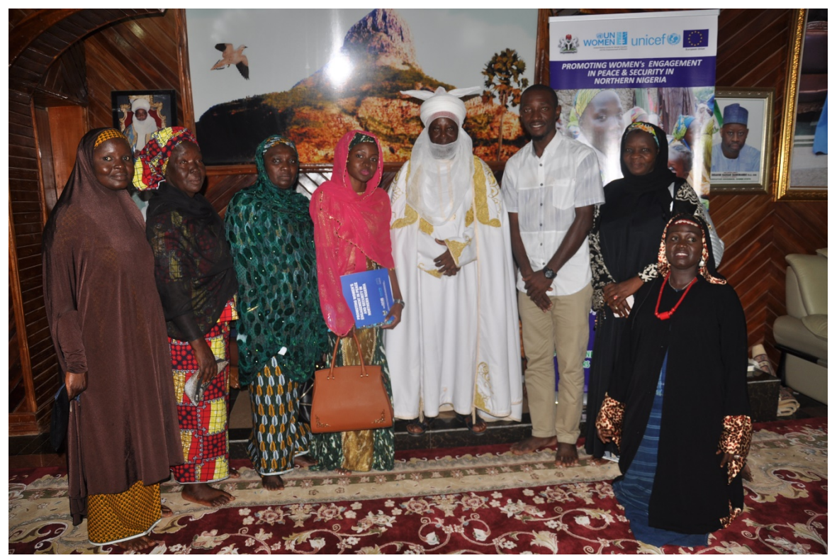
A few female title holders with the Emir of Kaltungo during a UN Women visit.

The Nigerian traditional system—like many other structures in the country—is patriarchal in nature and often excludes women from decision-making positions. In most parts of the country, women are not included in peace negotiations and are generally rarely given the opportunity to participate in governance. This situation is exacerbated by the violent conflicts that have reverberated through the various regions, especially the north. The above said, one kingdom stands out in the Sahel grassland area of Gombe State. An important role model, the Kaltungo Kingdom engages women as peace builders and community leaders, visibly represented in the traditional council led by the Emir, His Royal Highness, the Mai of Kaltungo, Alhaji Sale Mohammed.