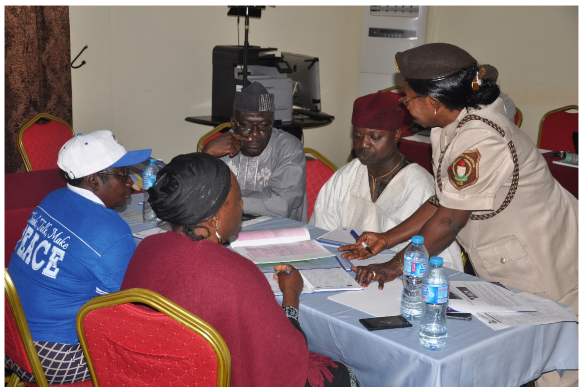
Interactive session at the stakeholders meeting for the review of the Plateau State action plan on UNSCR 1325.