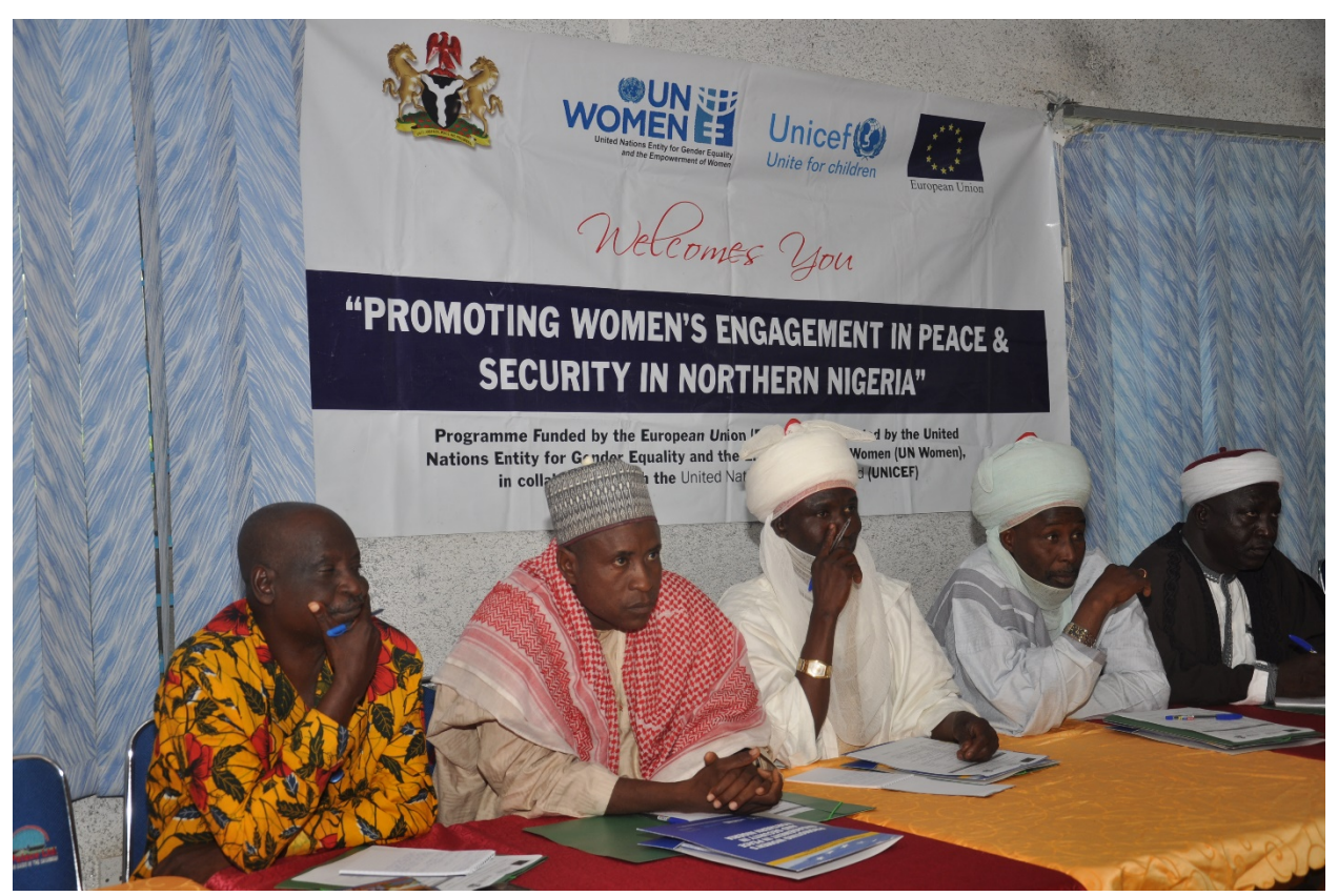
Traditional leaders at the capacity building workshop on gender related issues in Gombe State.