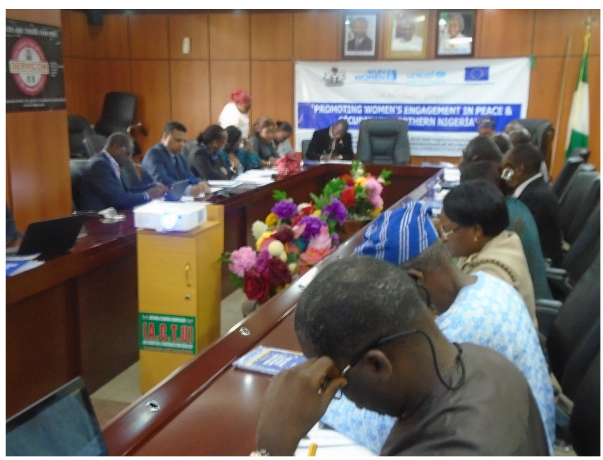
Cross section of stakeholders at the Programme Steering Committee Meeting in Abuja.

A national Programme Steering Committee (PSC) meeting for the Northern Nigeria Women, Peace and Security Programme was held at the Federal Ministry of Budget & National Planning (MBNP) in Abuja on 2 August. The meeting had in attendance 30 stakeholders drawn from 13 organisations, including government ministries, departments and agencies (MDAs), UN Women Civil Society Advisory Group, civil society organisations (CSOs), security agencies, development partners, and UN Women.