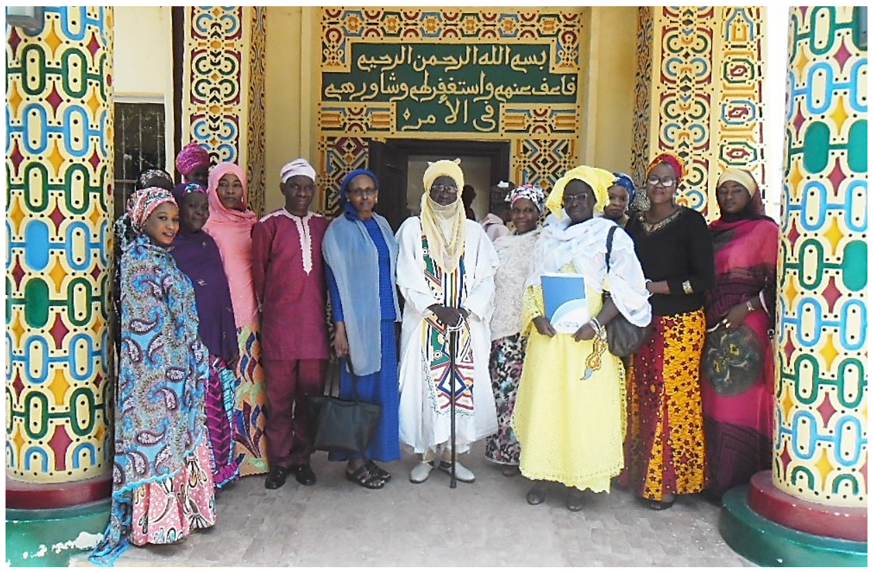
Some UN Women staff during a courtesy visit to the Emir of Kano.

"The important and strategic positioning of the role of women in any family or society—be it political, social or economic—is tied to development. Yet women are the most victimised in times of conflict ... our traditional institutions, cultures and religions in any part of the country respect and protect the integrity of women", said Alhaji Abbas Sanusi, the Galadiman of Kano and Senior Councillor of Kano Emirate Council, during a courtesy call made to the Emir of Kano on 13 July, at the ancient and historic Palace of Kano.