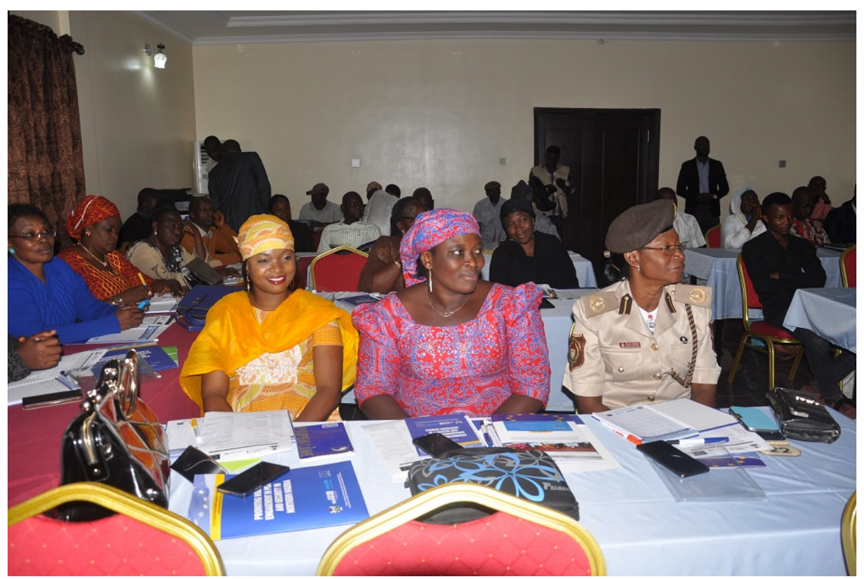
Cross-section of participants at the Stakeholders' Review Meeting on the Plateau State Action Plan.

In 2015, the Plateau State Ministry of Women Affairs and Social Development (MWASD) developed and launched the state's action plan on UNSCR 1325, making Plateau one of the few states that has adopted the plan to-date. The Women, Peace and Security (WPS) Plan was also integrated into the state government's