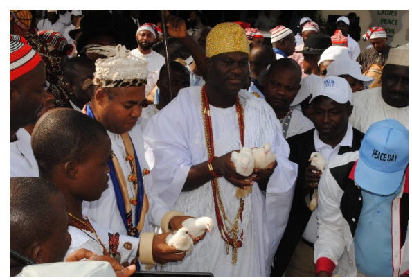
Traditional rulers and guests during the release of the doves.

At the end of the peace lecture, the chairman of the event, the Ooni of Ife, Oba Adeyeye Ogunwusi, joined other traditional leaders and guests to perform the release of white doves, symbolic of peace.