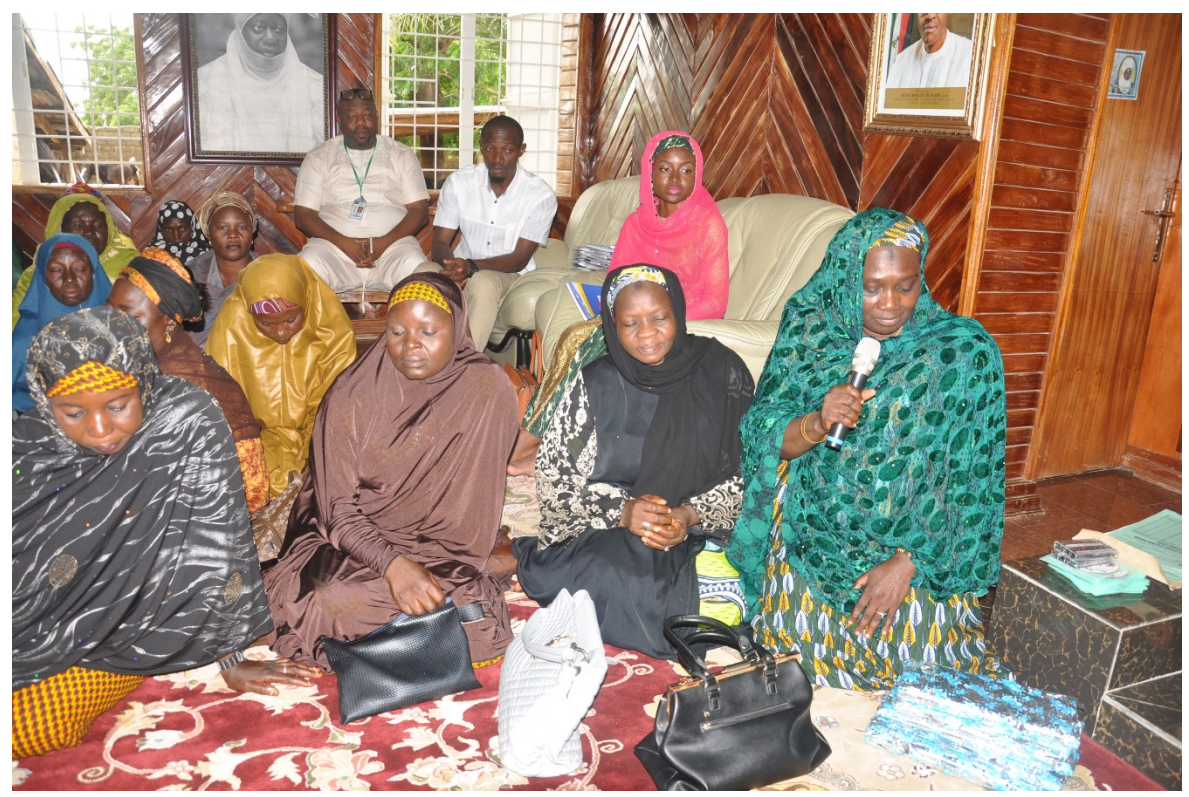
A female chief addressing other women at the palace of the Emir of Kaltungo in Gombe State.