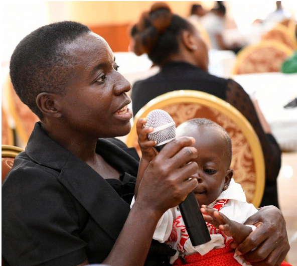
Individual grassroots women as well as technical staff from women's organisations shared their experiences in this feminist journey in Uganda