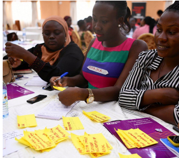
Other exercises involved mapping of the history of the women's movement in Uganda and identifying as well as celebrating feminist leaders in Uganda. The exercises enabled a deeper understanding of where the women's movement is going and how.

The workshop also strengthened the women's movement in Uganda to collaboratively advocate and campaign for women's rights and strengthen the understanding of the Spotlight Initiative, the largest targeted effort to end violence against women and girls. The women's movement aims to promote a strong and empowered civil society and autonomous movement by advocating for stronger laws and policies, ensuring civil society participation, building capacity of CSOs and strengthening networking opportunities.