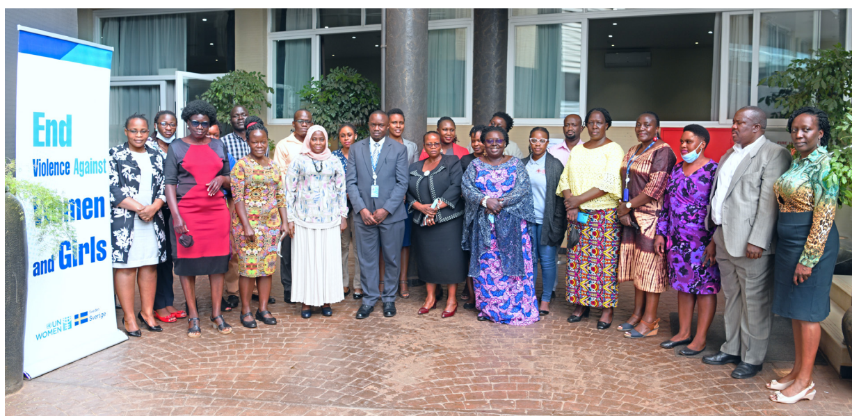
The debrief meeting had participants from Ministry of Gender Labour and Social Development, UN Women, Civil Society and Academia

Moreover, the government will integrate gender perspectives into the design, funding, implementation, monitoring and evaluation of policies and programmes on climate change mitigation, adaptation and resilience, disaster risk reduction, biodiversity protection, environmental degradation and pollution, including by chemicals, pesticides and plastics such as microplastics, as well as into needs assessments, forecasting and early warning systems, and disaster prevention, preparedness, response, relief, rehabilitation and reconstruction plans at the national, regional and international levels, as appropriate.