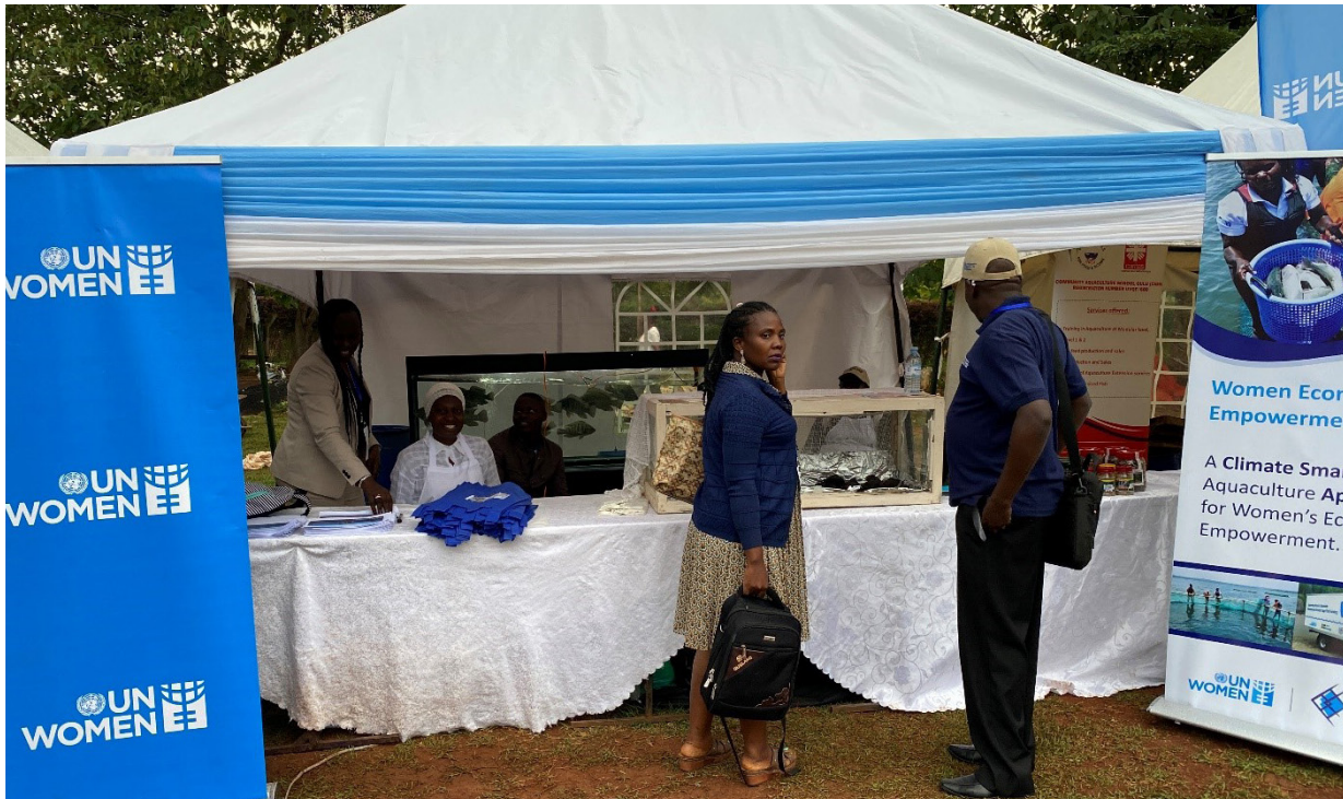
Members of the public and conference participants visiting the UN Women/WEEB stall to understand the work of UN Women in supporting fisheries in Uganda

“We also have a challenge of getting women to appreciate the value chain system all the way from fishing, marketing, storage and conservation in order to reap bigger,” she further notes.