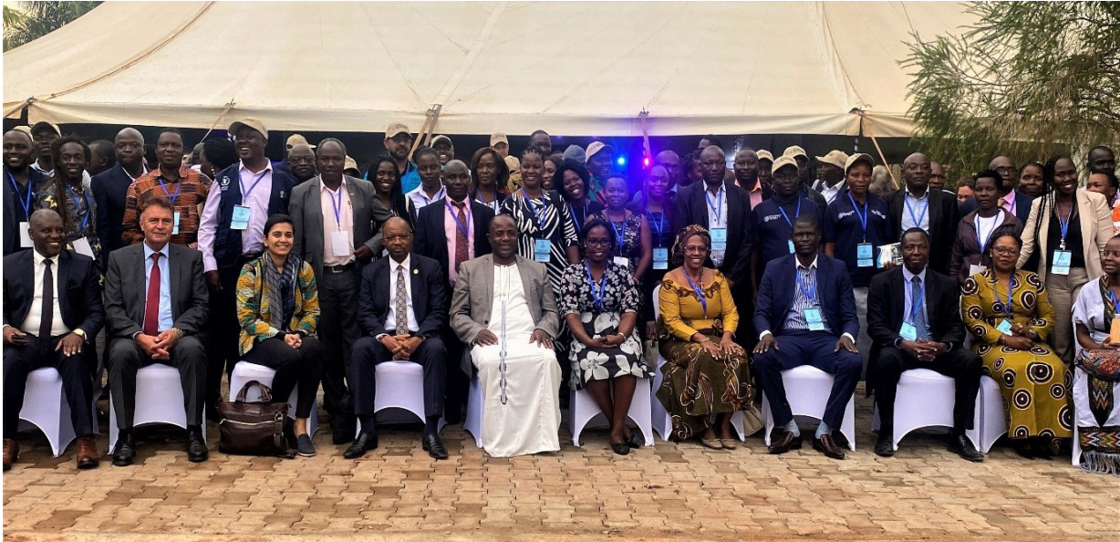
Participants in the International Conference of Artisanal Fisheries and Aquaculture (ICAFA) at the Source of the Nile Hotel in Jinja

In commemoration of the United Nations International Year of Artisanal Fisheries and Aquaculture (IYAFA 2022), Uganda hosted a three-day International Conference of Artisanal Fisheries and Aquaculture (ICAFA) at the Source of the Nile Hotel in Jinja under the theme, “Breaking new grounds to recognize and celebrate the contribution of smallscale fishers towards food security and nutrition”.