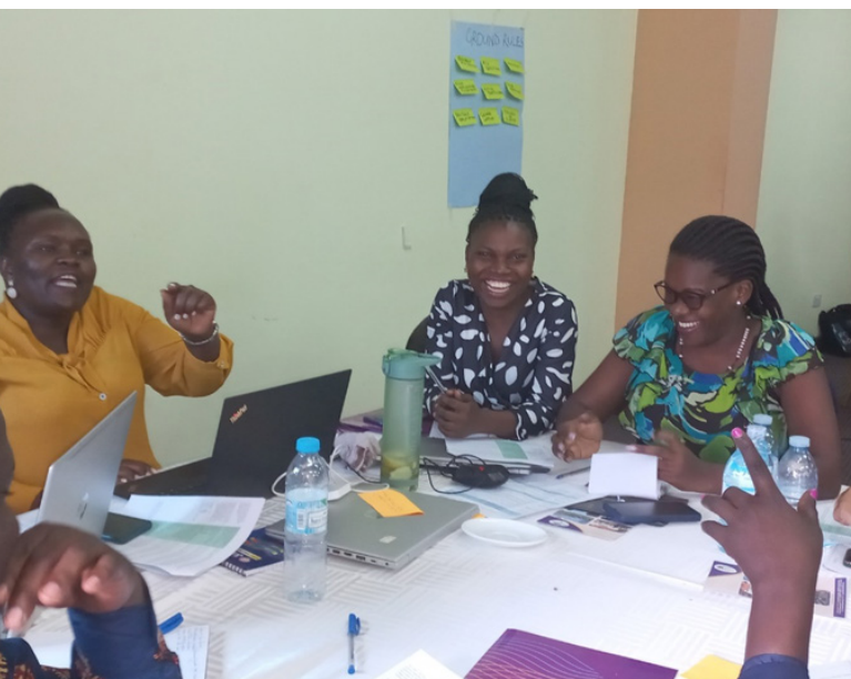
Some of the participants engaged in a small group discussion on indicator definitions and measurements

Through the same program, the capacity of 667 women was enhanced enabling them to lead and participate in formal and informal peace building and conflict prevention processes and to serve on peace committees at district and subcounty levels.