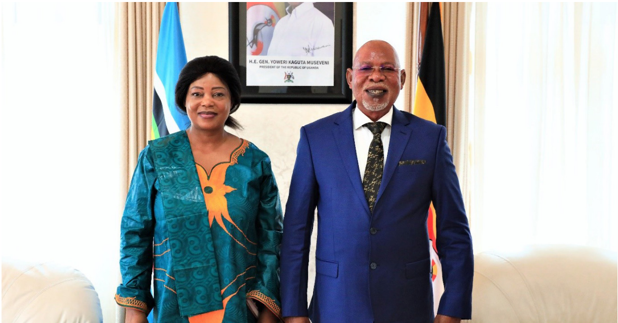
UN Women Representative Paulina Chiwangu and Uganda's Minister of Foreign Affairs Hon Gen Jeje Odongo at her accreditation event at the Ministry of Foreign Affairs headquarters

Ms Paulina Chiwangu formally assumed duty as UN Women Country Representative on 4th August 2022 after presenting her credentials to Uganda's Minister of Foreign Affairs, Hon General Jeje Odongo. The presentation took place at the Ministry of Foreign Affairs (MOFA) and was witnessed by dignitaries from MOFA and the UN Women Uganda