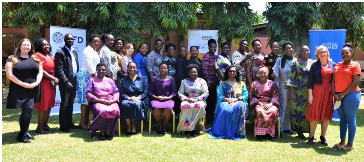
Officials and participants from UN Women, CPA UK, UWOPA and Parliament of Uganda attended the training.

UN Women, Commonwealth Parliamentary Association UK Branch (CPA UK), and Uganda Parliamentary Women Association (UWOPA) collaborated to provide women parliamentarians with the knowledge and abilities to feel more self-assured and have a greater impact on the Ugandan Parliament for high-quality work.