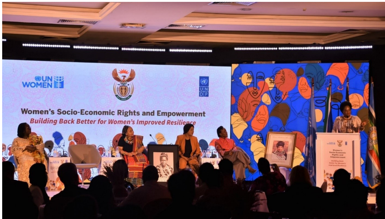
Minister of Gender, Labour and Social Development, Hon Amongi addressing the guests as UN and South African High Commission officials look on at the commemoration of the Women's Month

UN Women joined the South African High Commission in Uganda to recognize the heroes who paved the way for women empowerment. This was at an event organized by Her Excellency, Lulama Mary-Theresa Xingwana, of the South African High Commission in Uganda in partnership with the United Nations Family, represented by the United Nations Resident Coordinator, UN Women and UNDP, under the theme: "Women's Socio-Economic Rights and Empowerment: Building back better for Women's Improved Resilience".