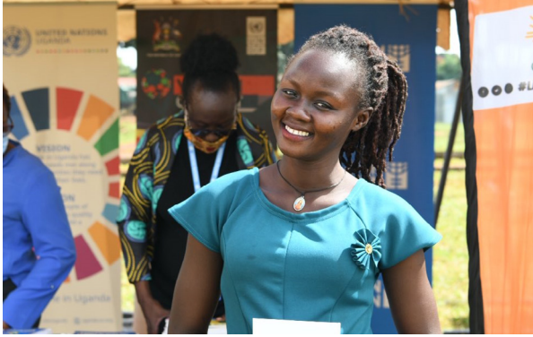
A young innovator poses outside the UN Exhibition Stall in Gulu City at Youth Day. She was displaying baked goods that were produced using a solar powered oven

H.E. the President Yoweri Museveni highlighted the importance of wealth creation for the youth through the four areas of commercial agriculture, industry, services provision, and technology. The President further appealed to the UN to support interventions to mitigate the effects of climate change for national development.