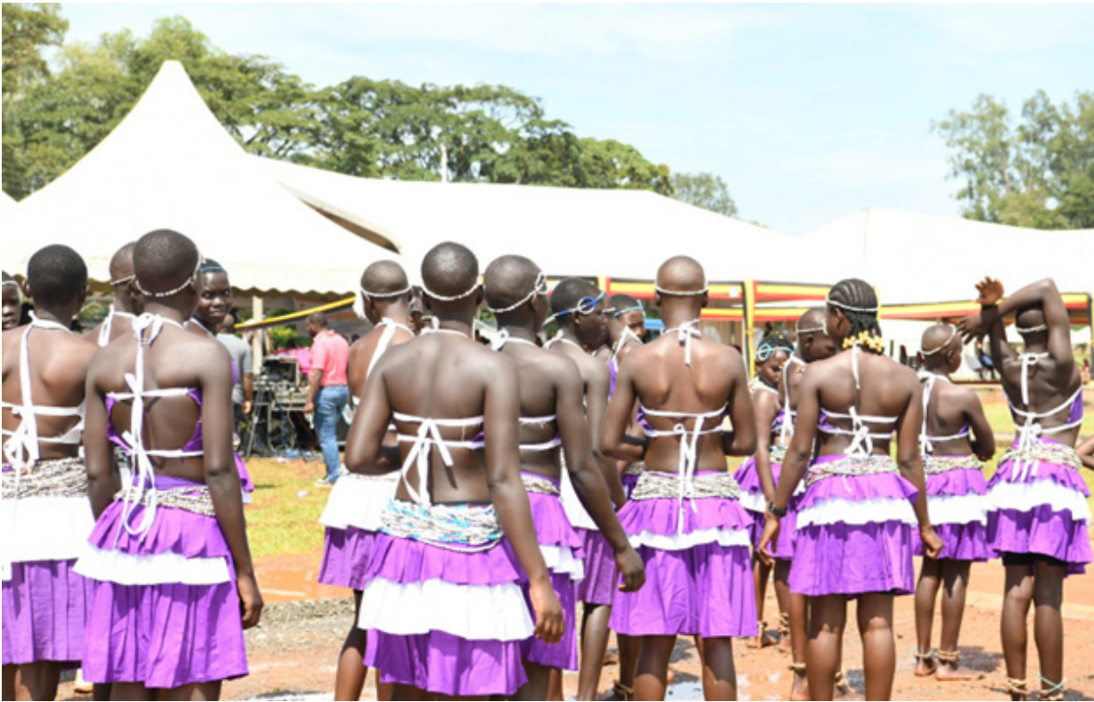
Youth cultural performance groups grace the day celebrating the talent and creativity of Uganda's youth