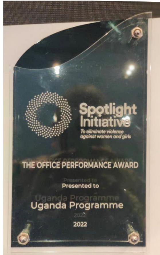
Spotlight Initiative Award for “Office Performance” issued in Cancun to the UN team in Uganda

Uganda has received a leadership award for the implementation of the Spotlight Initiative at the Global Spotlight Symposium to End Violence Against Women and Girls held in Cancun, Mexico. UN Women is a key implementing agency for the Spotlight Initiative that seeks to eliminate sexual and gender-based violence against women and girls. Some of the key interventions have been on social norm change around harmful practices, systems strengthening, and law and policy implementation, among others. This meeting in Mexico was held to bring together EVAW Programme colleagues from