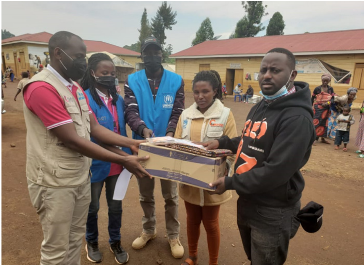
The OPM command on the right receiving dignity kits from UN Women implementing partners CoACT.

As the conflict in the Democratic Republic of the Congo (DRC) continues, the situation remains unpredictable along the Kisoro border posing challenges for asylum seekers, especially for women, girls and children. As of September 4 2022, the UNHCR daily Kisoro Emergency Situation Update No.160 reported that an estimated 15,691 individuals are currently living at both the holding and transit centres in Nyakabande with 2,171 at the transit centre and 13,520 at the holding centre. Since March 28, 2022 an estimated 49,261 individuals have been at both the holding and transit centre.