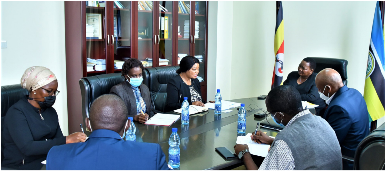
The UN Women led by Paulina Chiwangu meets with Prime Minister, Right Honorable Robinah Nabbanja's team at the Office of the Prime Minister in Kampala.

The UN Women Representative to Uganda Paulina Chiwangu met with the Prime Minister of Uganda Right Honorable Robinah Nabbanja at the Prime Minister's Office in Kampala. They discussed a myriad of issues including collaboration opportunities between UN Women and the Government of Uganda, with the Hon Nabbanja commending UN Women for, "pushing for the empowerment of women and gender equality in the country."