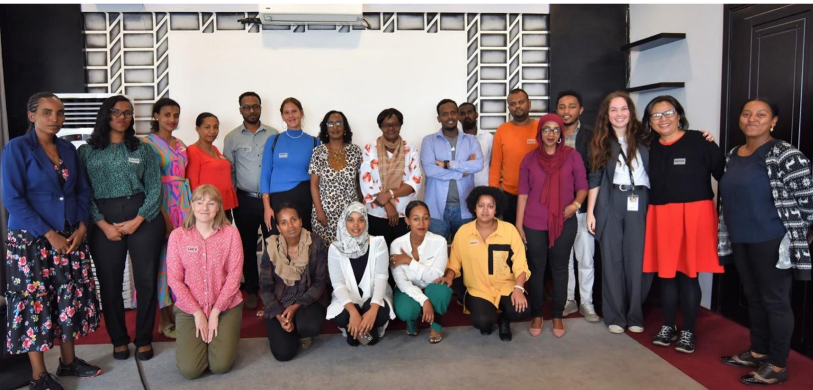
Photo: Participants of the Second round ToT 3-5 April 2023 organized by UN Women in collaboration with the Inter-Agency PSEA Network.

As the co-chair of the Ethiopia PSEA Network, UN Women Ethiopia leads the implementation of the Secretary-General's Bulletin on Special Measures for PSEA (ST/SGB/2003/13) in Ethiopia, which emphasizes the UN's vision for both preventing and responding to SEA through training and awareness raising.