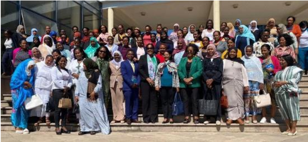
Photo: Participants of the Transformative Leadership for Gender Equality training.

The 'Strengthening institutional and parliamentarians' capacity for gender responsive Parliament in Ethiopia' Project that is implemented by HOPR in collaboration with UN Women is generously funded by Sweden, Netherlands, Irish and Norway.