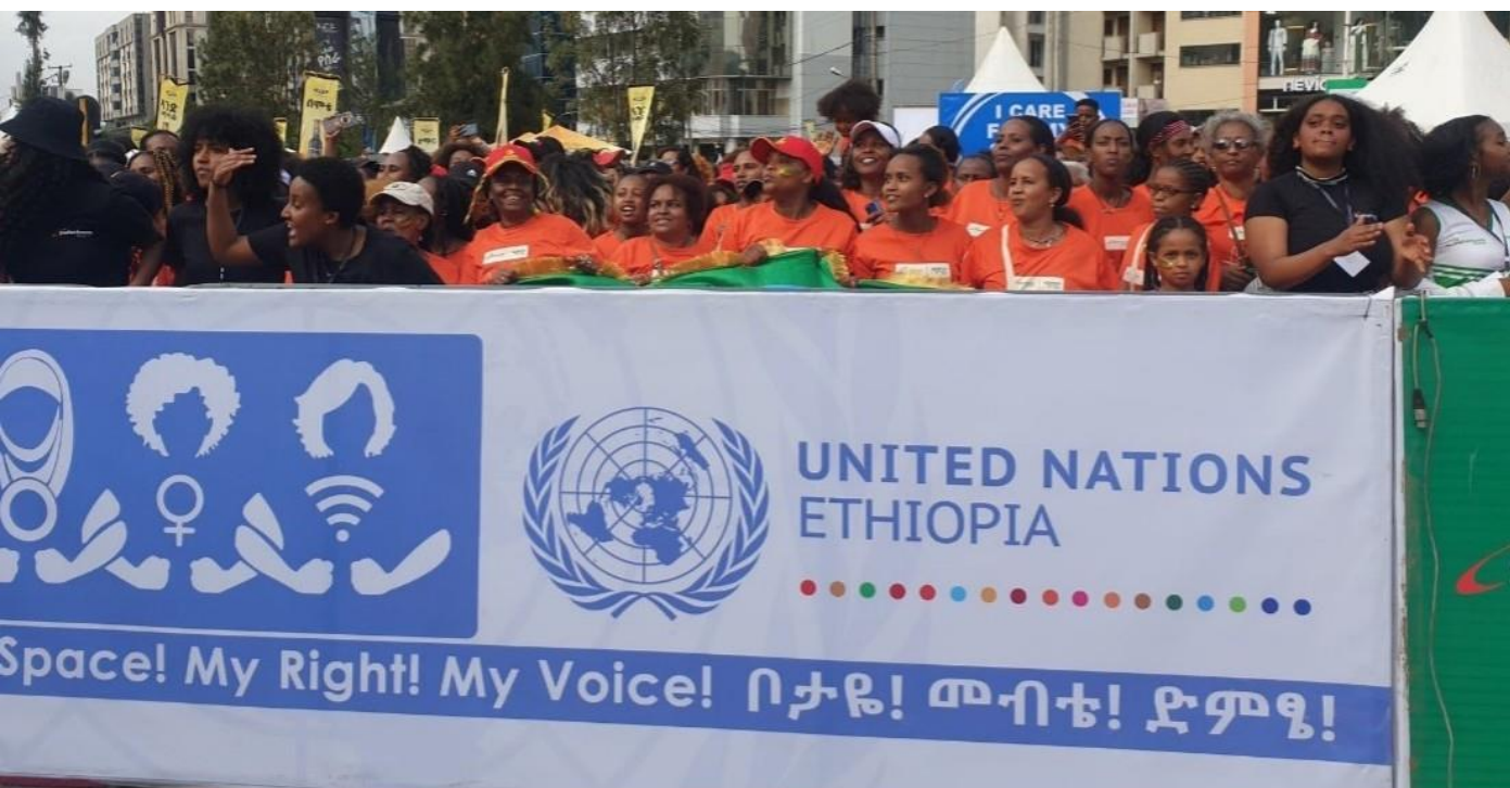
A Photo: Participants of the 2023’s Women 5k Run. Photo: UN Women/Fikerte Abebe

The WOMEN FIRST 5km, a women’s-only run organized by the Great Ethiopian Run in Addis Ababa, started in 2004 – the same year as the Athens Olympics – to recognize the achievements of Ethiopia’s great female