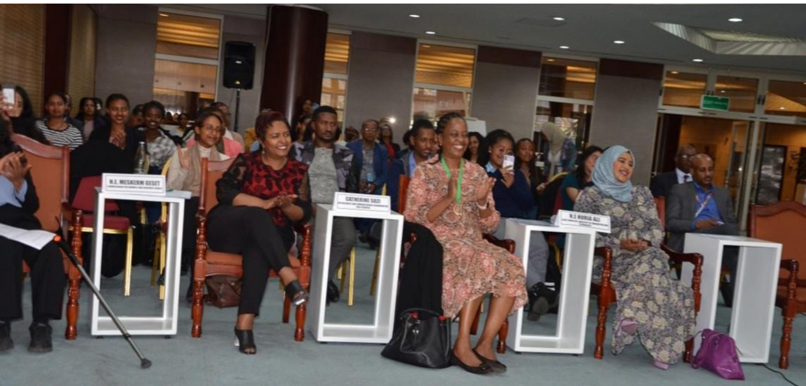
Partial view of participants of the event.