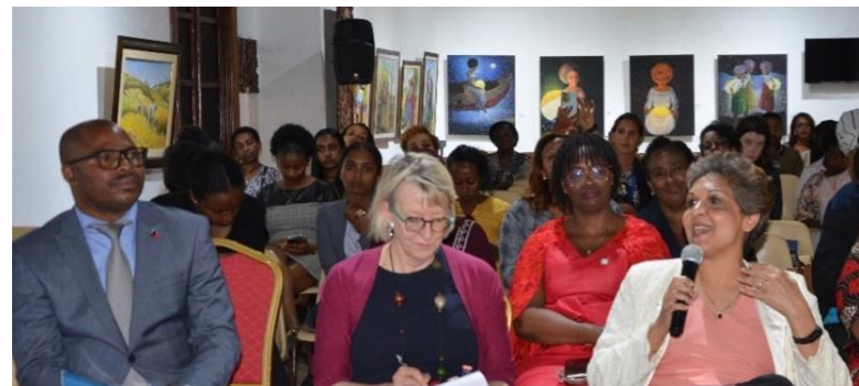
A Photo: panelists (left) representing Addis powerhouse, Ethiopian Human Rights Defenders Center, Ethiopian Media Women Association, Setaset Power and Addis Ababa Women Children and Social Affairs Bureau (right), event participants in a discussion