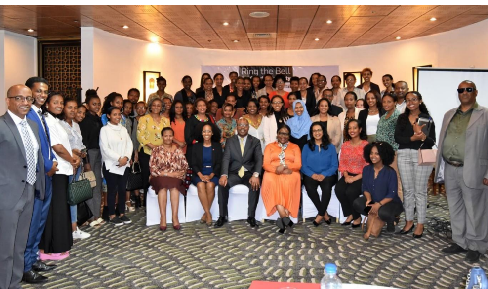
Photo: Group Photo of Participants of the RTB celebration.