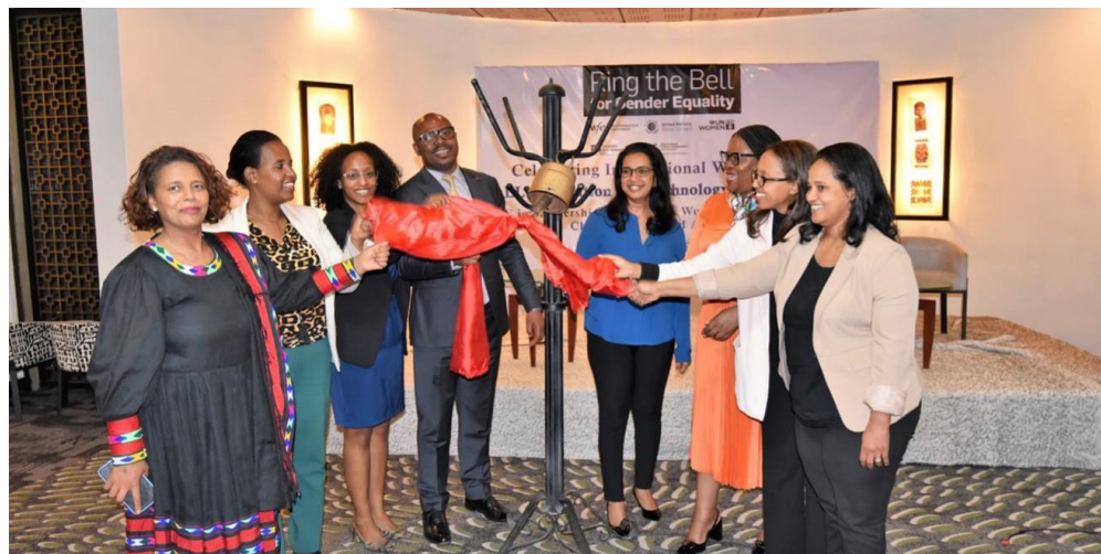
Photo: symbolic ringing of the bell was part of the RTB 2023 celebration: Photo:UN Women/Tensae Yemane