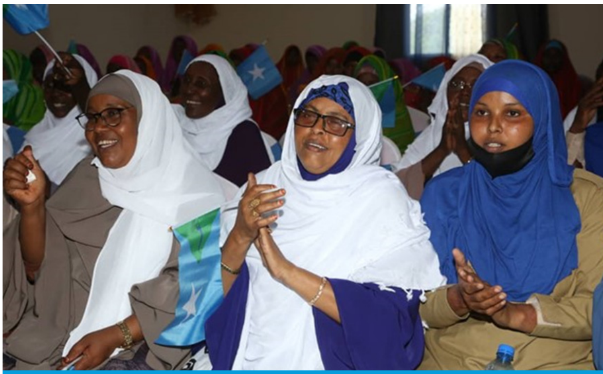
Ministry of Women Human Rights Development commemoration of the international women’s day on 8th March 2023.