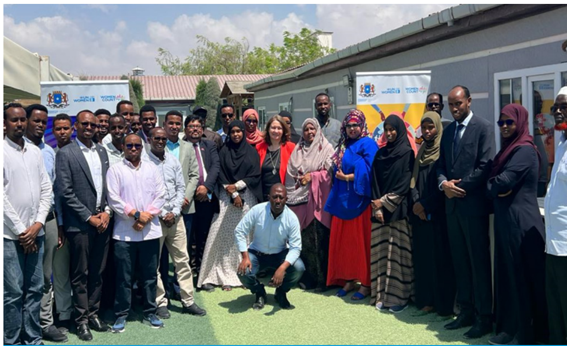
The team from the SNBS and players from the criminal justice system in the GBV Crime statistic workshop in Mogadishu held on 6th and 7th of March 2023.