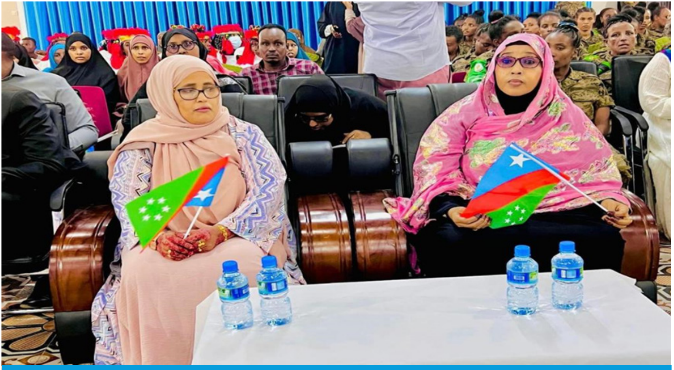
Honorable Minister Fahima Osman During the commemoration of the IWD in Southwest state

DigitALL was a celebration of women’s achievements and the tireless work of women leaders and freedom fighters in Somalia. The Ministry of Women and Human Rights Development has taken the lead to achieve a 30% women’s quota in the election, and the South-West Minister of Women and Human Rights Development has called on the police to be more vigilant and protect women and young children during the night.