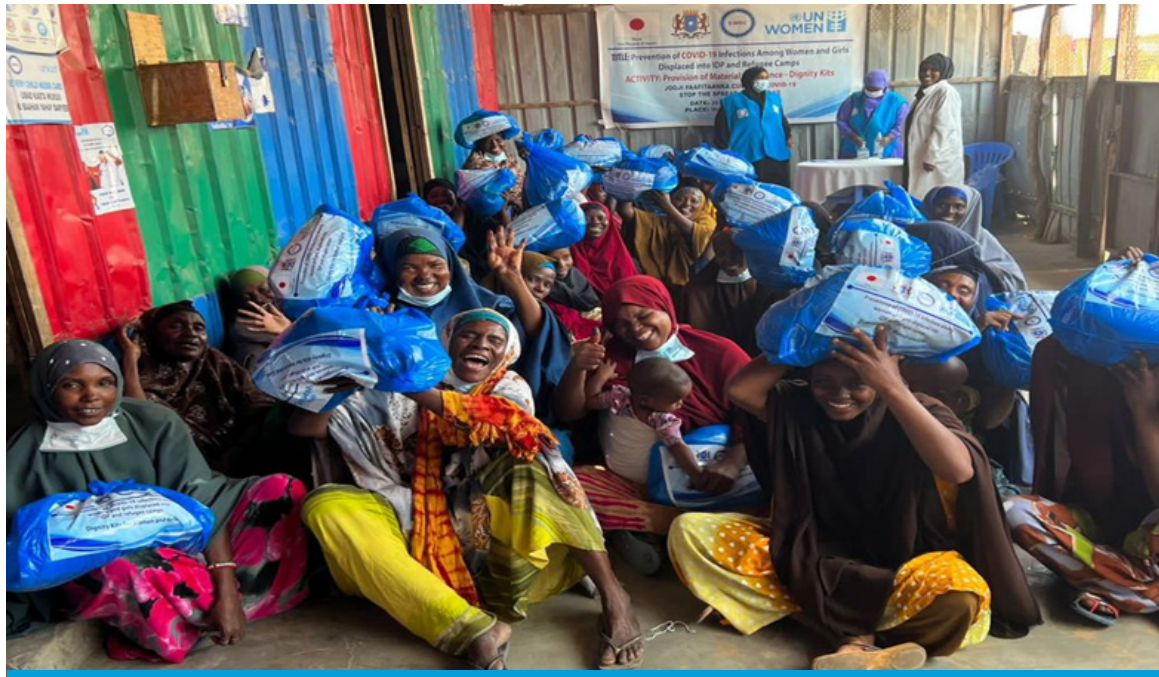
Distribution of dignity kits to IDP women and girls in Mogadishu.