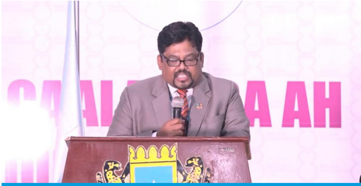
UN Women Country Programme Manager during the commemoration of the international women’s Day on 8th March 2023.

tics and leadership positions. It was inspiring to see the efforts of UN Women Somalia and other stakeholders in promoting gender equality.