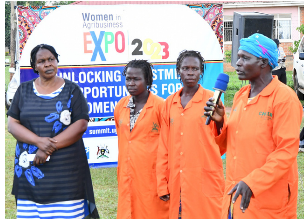
Beneficiaries of Climate Smart Agriculture Programme implemented by Delight Uganda in Partnership with UN Women sharing experiences with other Exhibitors

“Buoyed by this newfound knowledge, I envision elevating my product's presentation. Gone are the days of modest packaging; I'm setting my sights on collaboration with an investor to craft vibrant branding that captivates consumers. This rejuvenated aesthetic won't merely be superficial; it will serve as a beacon of information. Each label will proudly detail how my Shea butter actively contributes to disease prevention, safeguarding both children and adults. This expo isn't just an event; it's a catalyst for change, propelling us towards brighter futures and broader horizons”.