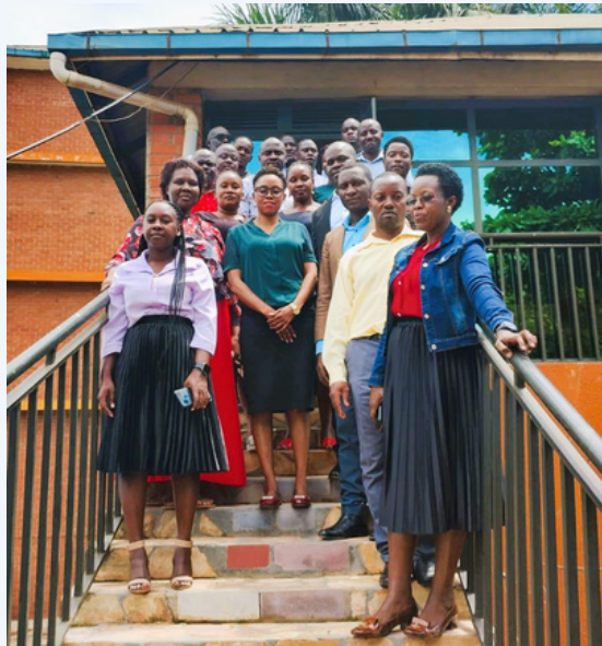
Representatives from 15 local governments for greater Masaka region pose for a photo at the end of the gender equality training.

Advocating for the utilization of data-driven insights to inform decision-making and policy formulation, particularly focusing on gender-specific statistics to enhance understanding and address disparities