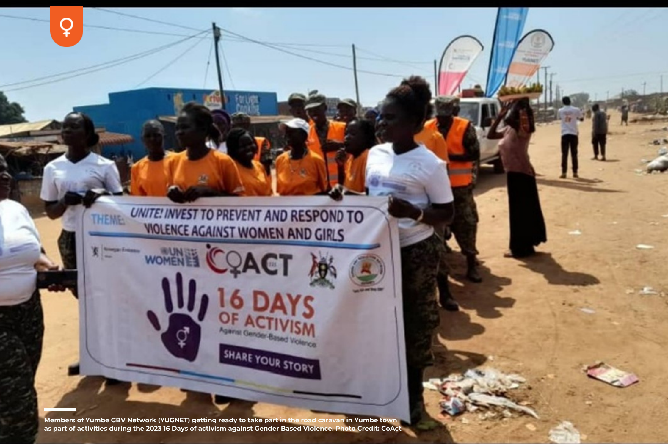
Members of Yumbe GBV Network (YUGNET) getting ready to take part in the road caravan in Yumbe town as part of activities during the 2023 16 Days of activism against Gender Based Violence.