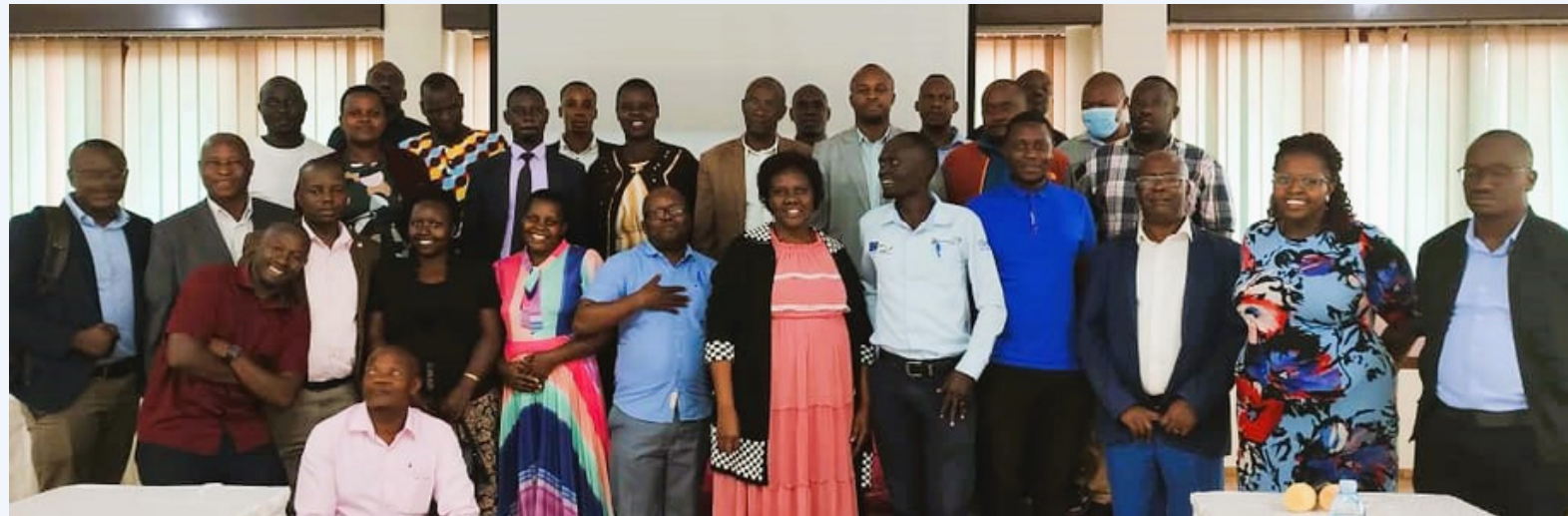
Representatives from 15 local governments pose for a photo at the end of the regional level training on gender equality in Mbarara city