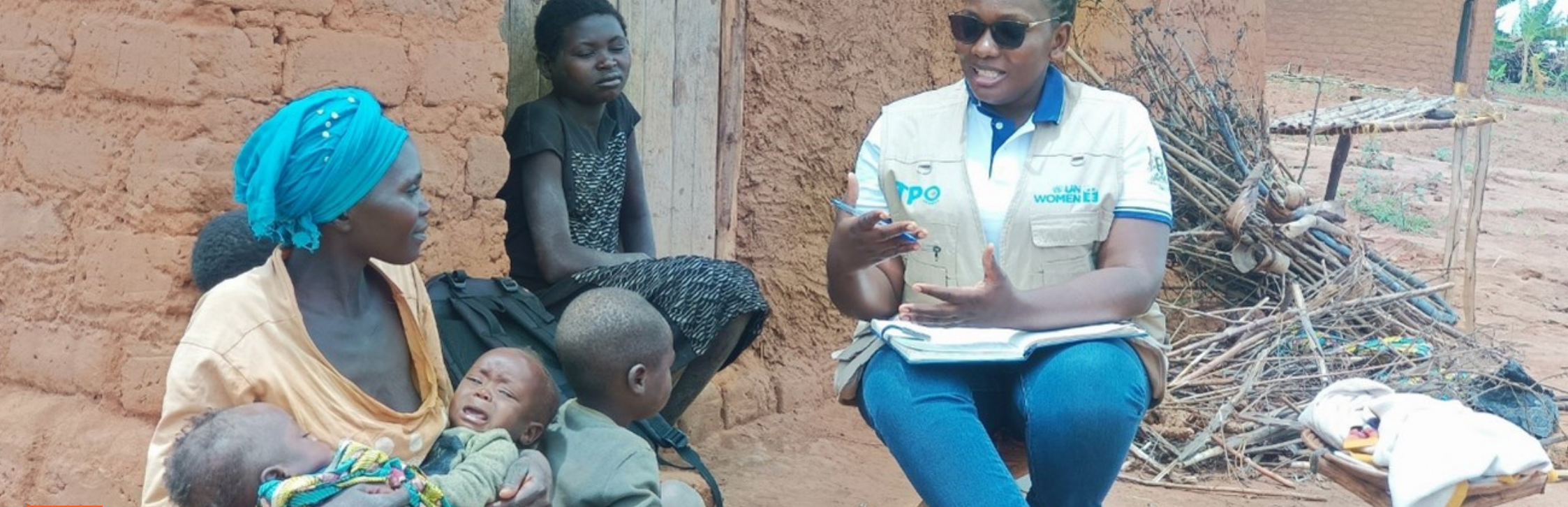
TPO staff during the follow up visit at Uwimaneza's house