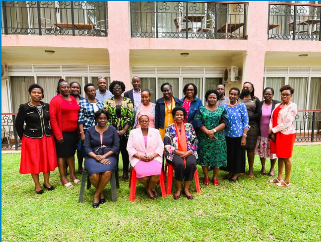
UN Women staff pose for a group photo at the end of a workshop gender equality and Imperial Resort Hotel in Entebbe

In the heart of Entebbe, Uganda, representatives from diverse sectors convened for a crucial workshop. Their objective? To formulate a gender equality position paper guiding the NDP's strategic goals, promoting sustainable development and inclusive growth for the nation.