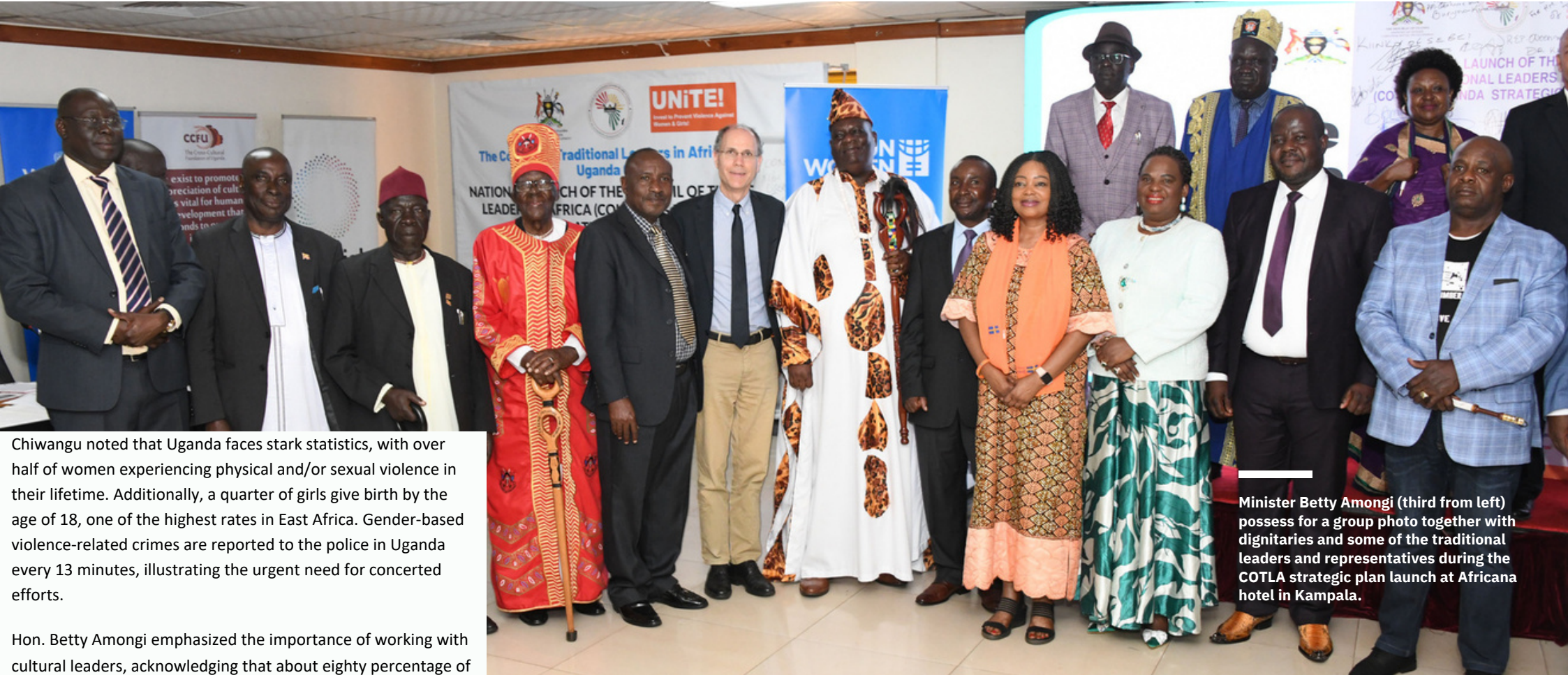
Minister Betty Amongi (third from left) poses for a group photo together with dignitaries and some of the traditional leaders and representatives during the COTLA strategic plan launch at Africana hotel in Kampala.

Chiwangu noted that Uganda faces stark statistics, with over half of women experiencing physical and/or sexual violence in their lifetime. Additionally, a quarter of girls give birth by the age of 18, one of the highest rates in East Africa. Gender-based violence-related crimes are reported to the police in Uganda every 13 minutes, illustrating the urgent need for concerted efforts.