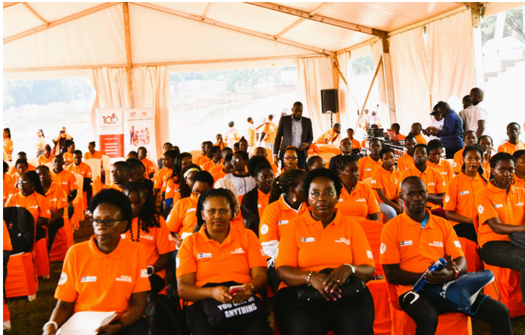
Makerere University staff members together with the students listen to the speeches during the 16 days' of activism event at the rugby ground