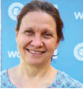
Dr. Isabella Schmidt UN Women East and Southern Africa

Introduction by ESA and the media: gender data as a vehicle for progress for all