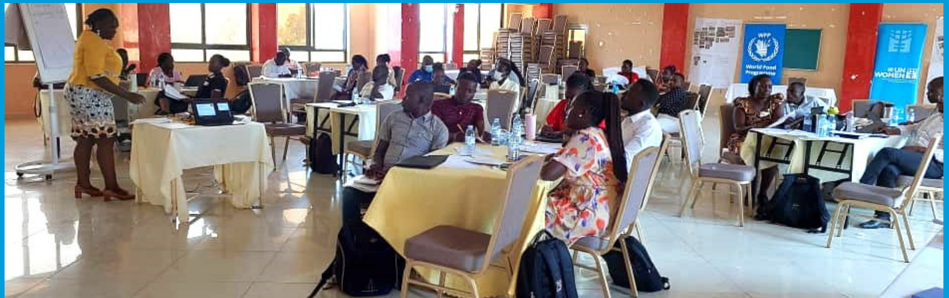
Caption: Gender in Humanitarian Action (GiHA) training of WFP IPs by UN Women Arua field staff members. This happened on 30th January 2024.