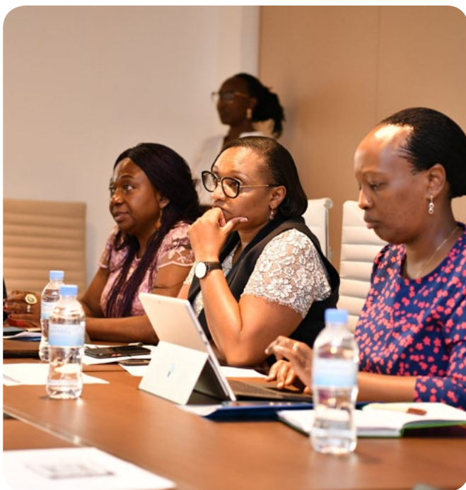
The UN Women Country Representative (left), Minister of Gender and Family Promotion (centre), and Chief Gender Monitor (right) at the pre-CSW preparatory meeting.

Ahead of CSW68 in New York, UN Women in partnership with the Ministry of Gender and Family Promotion convened all national stakeholders attending CSW68 meeting to brief the attendees on the history of CSW and its significance to the achievement of gender equality commitments on a global, regional, and national scale. This meeting also served to shape a common understanding and narrative that would guide Rwanda's participation and objectives for CSW68. The CSW took place from 11 - 22 March 2024 under the priority theme,