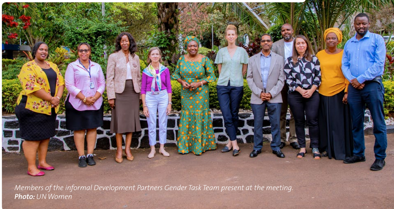
Members of the informal Development Partners Gender Task Team present at the meeting.

In the efforts to collectively inform actions towards gender equality, UN Women convened development partners for an informal gender group/task force for an interactive session to brainstorm and shape discussions in the upcoming national frameworks and development working groups on the 5th of April 2024, at UN Women. In attendance were Representatives from FCDO, Swedish Embassy GIZ, UN Women, UNICEF, WHO, UNRCO, UNFPA, IOM, EU (online). The informal DPs Gender Task Team is an outcome of the Breakfast Meeting organized by UN Women in collaboration with the Embassy of Sweden on the sidelines of the Women Deliver 2023 Conference in Kigali, which also coincided with UN Women Executive Director's country visit.