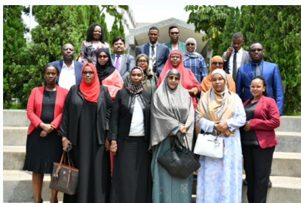
The delegation of women parliamentarians from Somalia with national partners, including the Ministry of Gender and Family Promotion and Parliament of Rwanda.

Taking place from the 29th of January to the 2nd of February 2024, UN Women Rwanda together with the Somalia Country Office, facilitated a study visit for a cohort of women parliamentarians came to to witness firsthand the significant gains registered by the country towards gender equality and women's empowerment. Throughout the week, the women parliamentarians met with a wide array of stakeholders including members of the Parliament of Rwanda, Ministry of Gender and Family Promotion (MIGEPROF), Ministry of Justice, Ministry of Finance and Economic Planning, the Gender Monitoring Office (GMO), Rwanda Governance Board, partners from civil society, and many more.