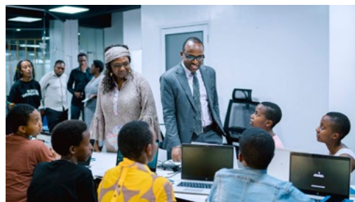
Hon. Minister of Education and the UN Women Representative visiting the AGCCI participants during a coding session.

During these sessions, the girls were also inspired by prominent guests such as Hon. Gaspard Twagirayezu, Minister of Education in Rwanda, Mr. Thorsten Schafer Gumbel, Chair of the GIZ Management Board, and Edyne Umuhoza, a young female pilot from Rwanda.