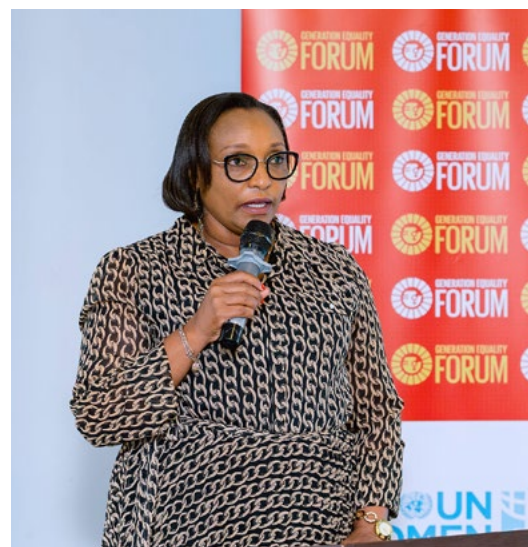
Hon. Minister of Gender and Family Promotion delivering opening remarks at the GEF bi-annual meeting.