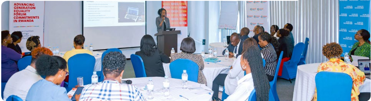
Diverse stakeholders contributing to Rwanda's Generation Equality commitments present at the bi-annual reflection meeting.

On 28 March 2024, UN Women in collaboration with the Ministry of Gender and Family Promotion convened over 40 stakeholders from government, development agencies, civil society, media and private sector at Ubumwe Grande hotel to move towards the implementation and realization of Generation Equality Forum commitments.