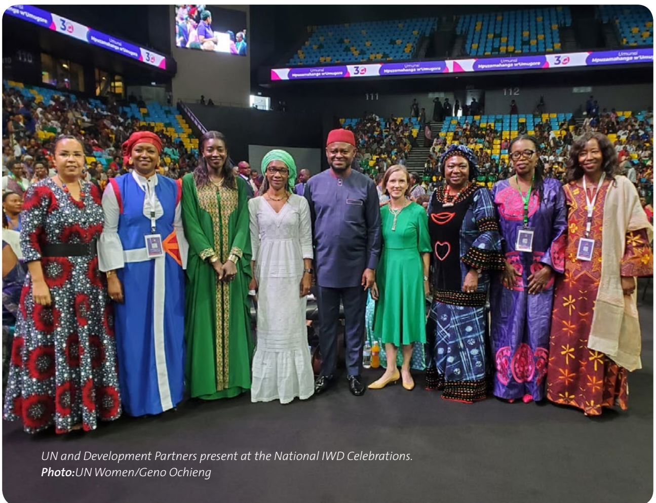
UN and Development Partners present at the National IWD Celebrations.