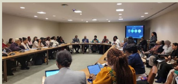
Diverse participants taking part in the CSW68 side event.

Countries shared their GRB programmatic experiences over the years as well as discussed efforts to institutionalize financing for GEWE through budget laws, dedicated budget lines, budget circulars and budget statements. Representatives also demonstrated how these had been enforced at both central and local levels. In attendance were: