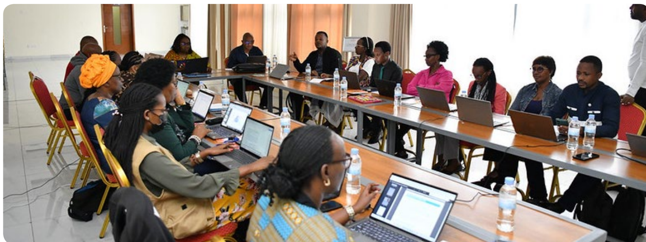
The UN Women Rwanda team during the week-long annual Staff Retreat.

The UN Women Rwanda Country Office has cultivated a culture of holding planning and reflection retreats on an annual basis to bring staff to speed on the programmatic and operational frameworks that guide its interventions, as well as promoting staff well-being. The UN Women Rwanda Country Office is also in the final year of implementing its Strategic Note (2019-2024) which is also the same year for initiating the development and approval of the next five-year Strategic Note. It is within this background that UN Women convened all staff for a four day retreat from 22nd to 26th April 2024 at Classic Resort hotel, in Musanze District to: