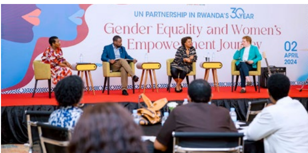
The celebrations entailed an insightful panel discussion featuring FCDO, Rwanda Women`s Network, Embassy of Sweden and UNDP.