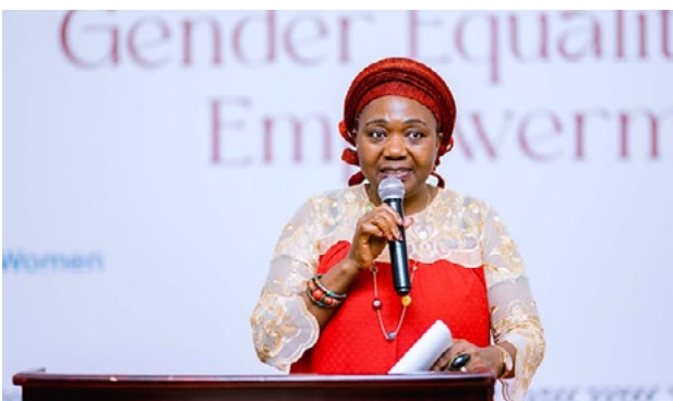
The UN Women Country Representative delivering closing remarks at the event.