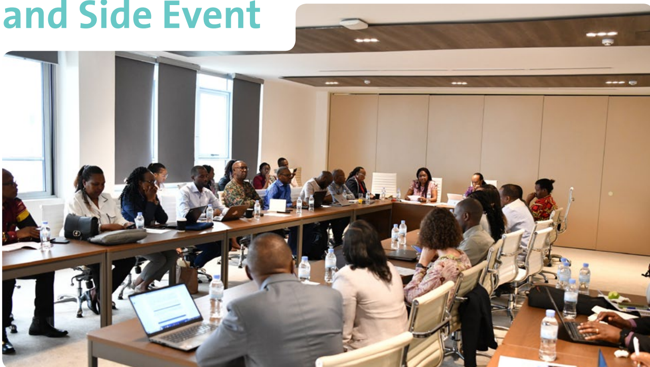
Rwanda delegates taking part in the pre-CSW preparatory meeting.