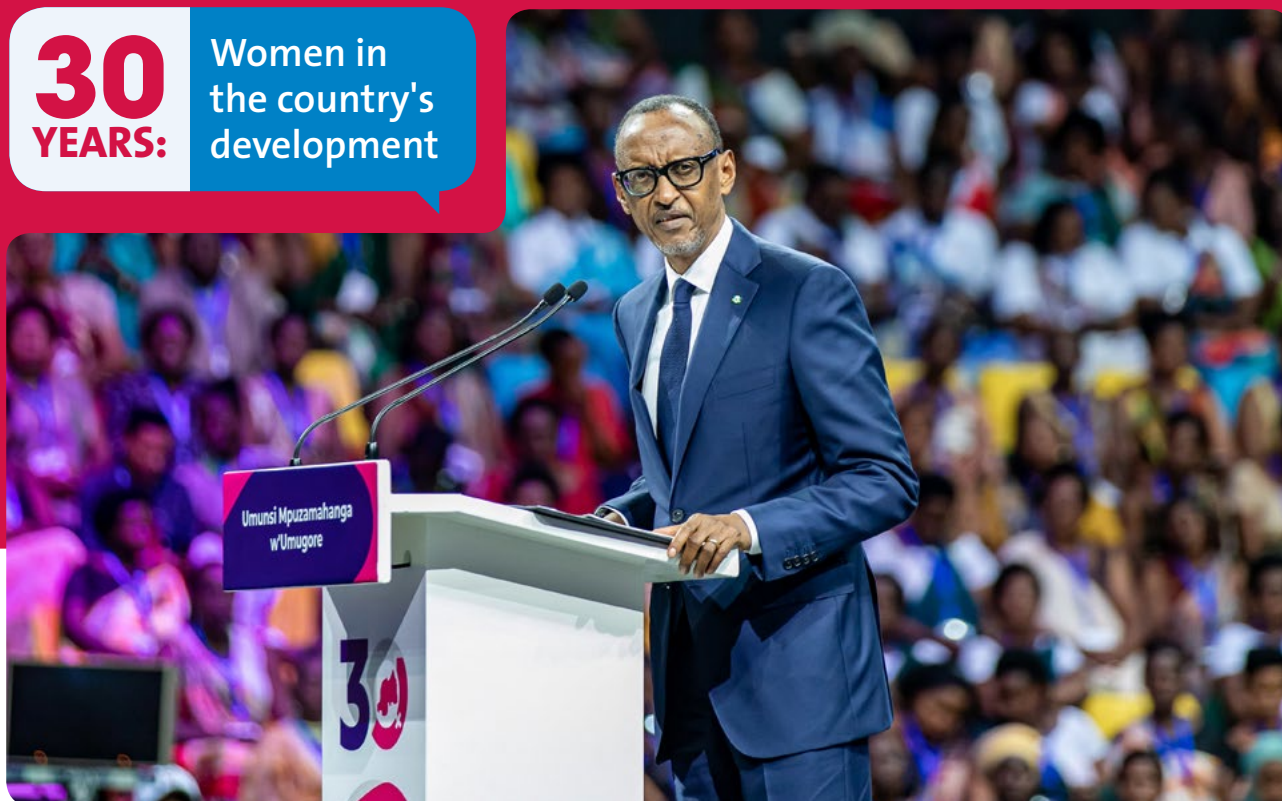
H.E Paul Kagame speaking at the IWD event at BK Arena.

The national IWD celebrations convened over 6000 participants at the Kigali BK Arena, the biggest sports complex in the country to celebrate Rwanda's remarkable journey towards gender equality and women's empowerment over the past 30 years, bringing together women leaders, government and development partners, youth, CSOs, security organs, HeForShe champions and media.