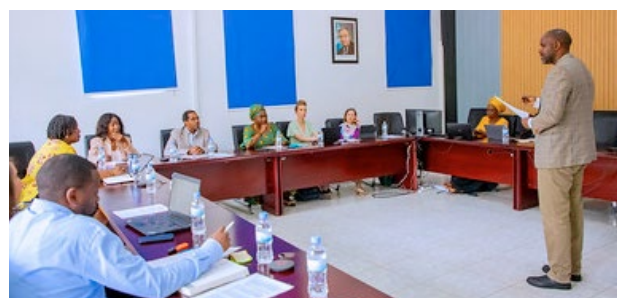
Participants at the informal Development Partners Gender Task Team meeting.

It was ultimately recommended that the informal DP gender group be strengthened through quarterly engagements in the UN Gender Theme Group (GTG).