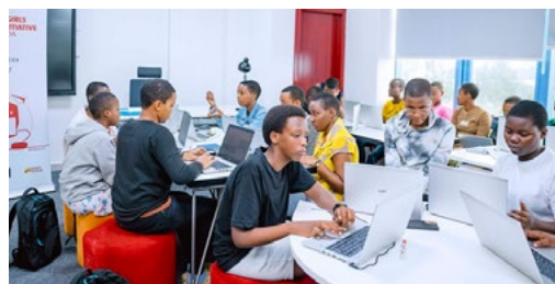
All 75 AGCCI participating girls were awarded laptops to foster their development in coding and robotics.

Following this bootcamp, each girl will also be part of the Siemens Empower Her mentorship programme that will connect them to prominent leaders in the ICT sector.