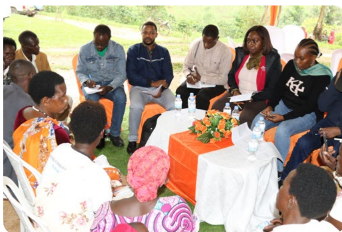
UN Representatives and JP-RWEE Technical Staff interacting with project participants during a focus group discussion.

Representatives of the four UN agencies participated in a half day high-level meeting and provided strategic guidance to the programme technical team and also took part in a full day joint field visit to select JPRWEE government partners and project beneficiaries.