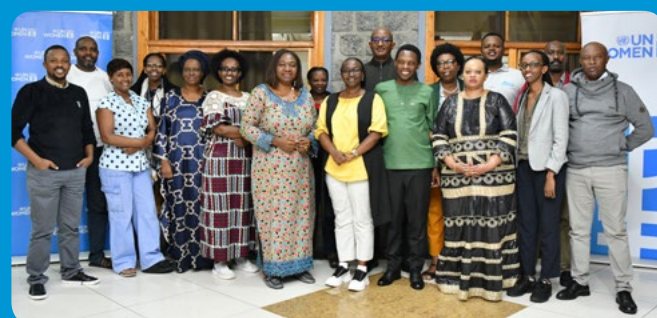
The UN Women Rwanda team during the annual staff retreat.