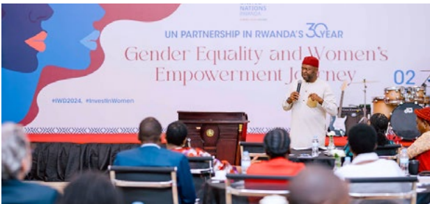
The UN Resident Coordinator delivering opening remarks are the UN Joint IWD event.