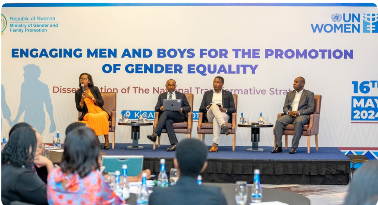
An interactive panel discussion featuring UN Women, Care International, AEGIS Trust and RWAMREC took place at the event.