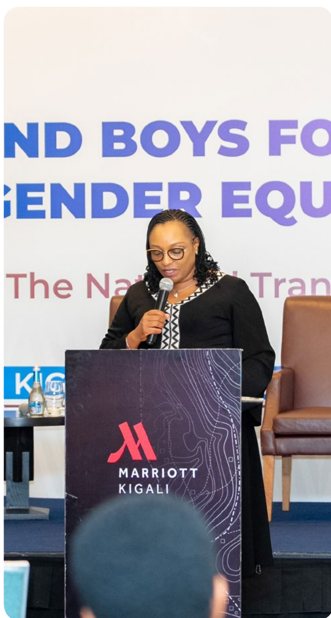
Hon. Minister of Gender and Family Promotion, Dr. Valentine Uwamariya delivering remarks at the event.

Rwanda has achieved significant milestones in gender equality and women’s empowerment, garnering global recognition as a gender champion. Despite commendable progress, inequalities still persist between men and women, particularly within socio-cultural systems which have been constructed through patriarchal norms that have historically favored men and boys, resulting in the marginalization of women and girls in various spheres, including economic participation.