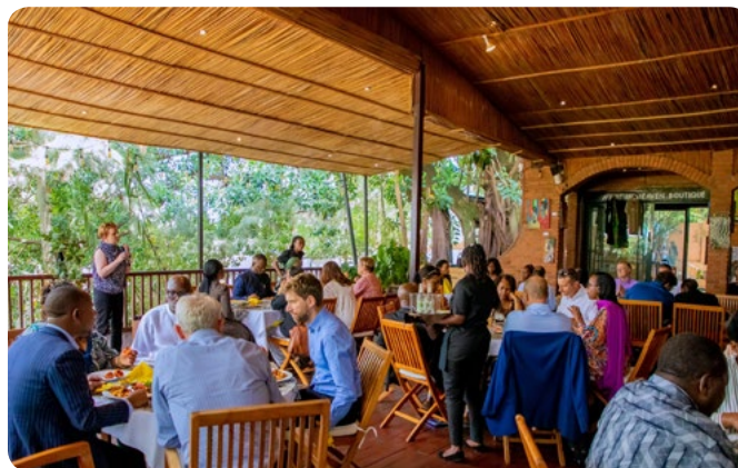
Development partners and Women`s Rights Organizations present at the Pre-IWD luncheon.