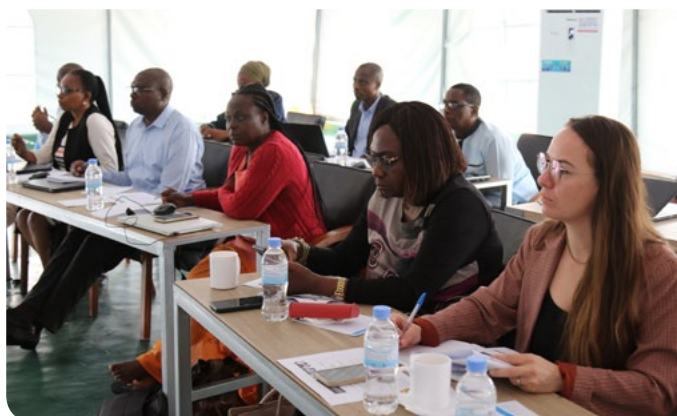
Participants during the JP-RWEE high-level workshop.

The first year of implementing the second phase of the JP-RWEE programme activities was geared towards creating strategic partnerships and preliminary work for implementation, including onboarding of new beneficiaries, fostering partnerships with new districts, selection and onboarding of implementing partners, and development of a baseline survey.