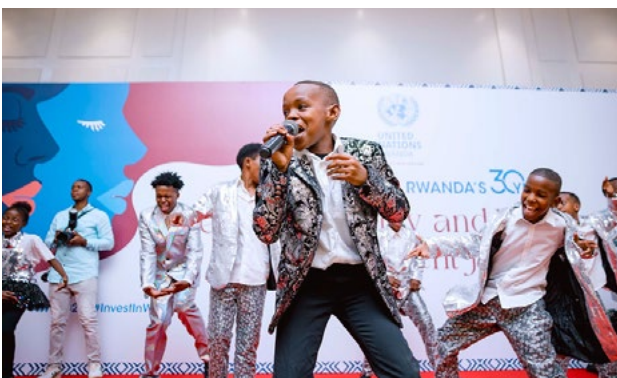
Young boys and girls from the Sherrie Silver Foundation giving an entertaining performance at the event.