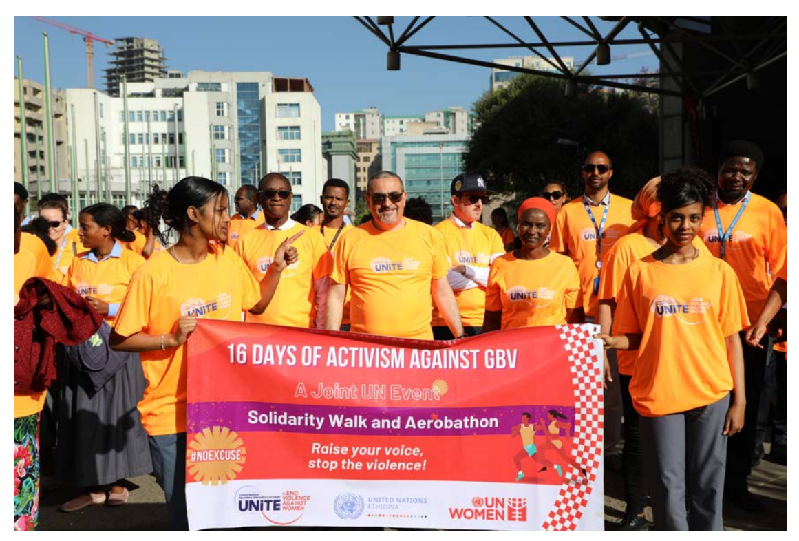
A joint event took place on 3rd December 2024 as part of the 16 days of activism commemoration.

Participants from the government, UN agencies, development partners, INGOs, CSOs, WROs, and students came together to walk and exercise with one united voice on the urgent need to eliminate Gender-Based Violence.