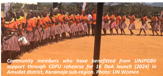
Community members who have benefitted from UNJPGBV support through CDFU rehearse for 16 DoA launch (2024) in Amudat district, Karamoja sub-region.

On 6th December 2024, Amudat District in the Karamoja sub-region of Uganda launched its 16 Days of Activism Against Gender-Based Violence at Kalas Primary School. The event was attended by several local leaders and community members.