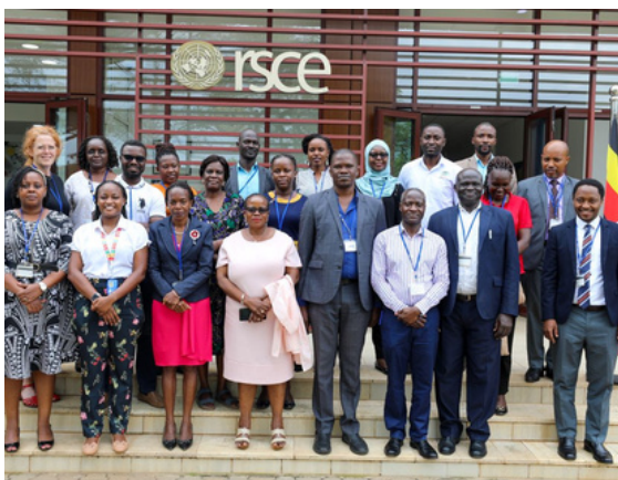
Gender Statistics Technical Working Group experts in a group photo at the end of a retreat in Entebbe.