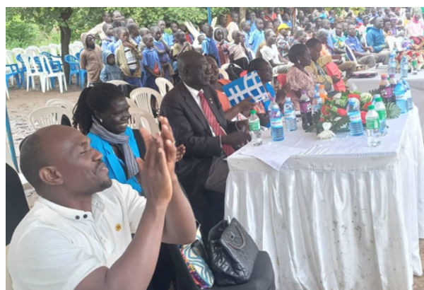
Guests react to speeches during the launch of 16 Days of Activism Against Gender-Based Violence Campaign 2024 in Adjumani district.

The launch of the 16 Days of Activism Against Gender-Based Violence in Uganda's West Nile region took place in the Oligi settlement in Adjumani District. The event was attended by key partners, including UNHCR, the Office of the Prime Minister (OPM), the Lutheran World Federation (LWF), Medical Teams International, World Vision, Plan International, Mercy Beyond Borders, Window International, UGANET, and local organizations.