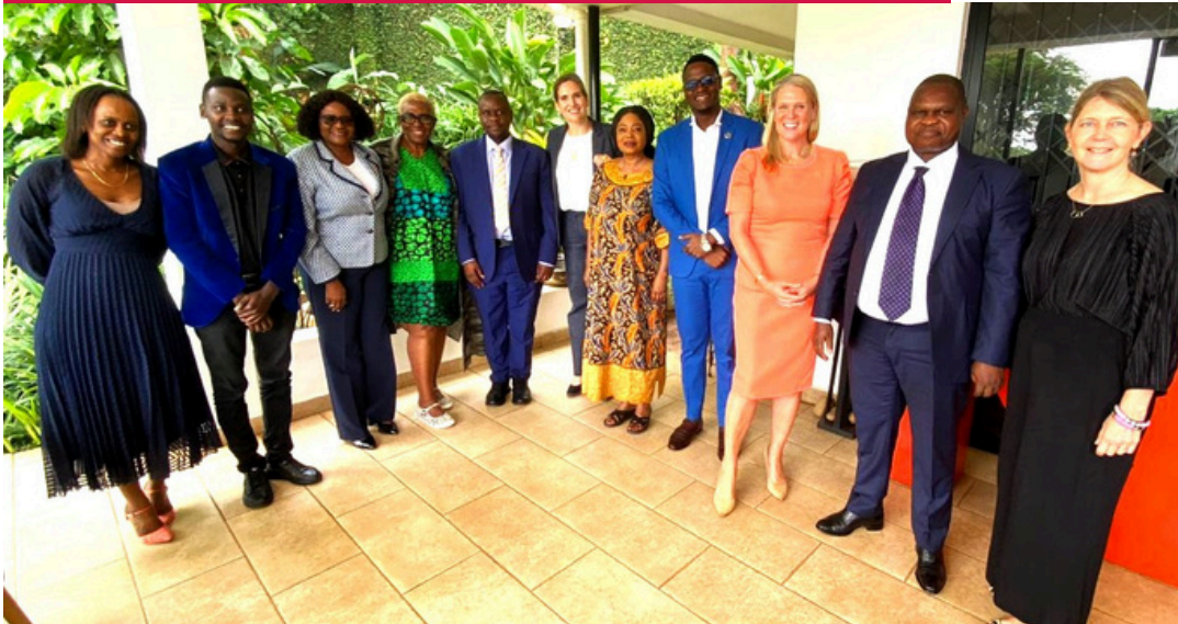
Heads of Missions, UN agencies, and male changemakers gather for a group photo following a breakfast meeting at the Netherlands Ambassador's residence.

This year marks 30 years since the adoption of the landmark global framework to advance gender equality and women's empowerment worldwide.