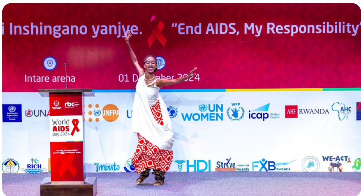
A Rwandan traditional performance at the national World AIDS Day celebrations.

On December 2, 2024, UN Women and the Rwanda Biomedical Centre (RBC) officially endorsed the Adolescent Girls and Young Women (AGYW) operational plan during a multi-sectoral meeting in Rubavu. The event, held alongside World AIDS Day, brought together stakeholders including PEPFAR, UNAIDS, UNFPA, and USAID to address the triple threats of HIV, adolescent pregnancy, and GBV among AGYW. The discussions focused on fostering effective partnerships, ensuring financial sustainability, and promoting accountability.