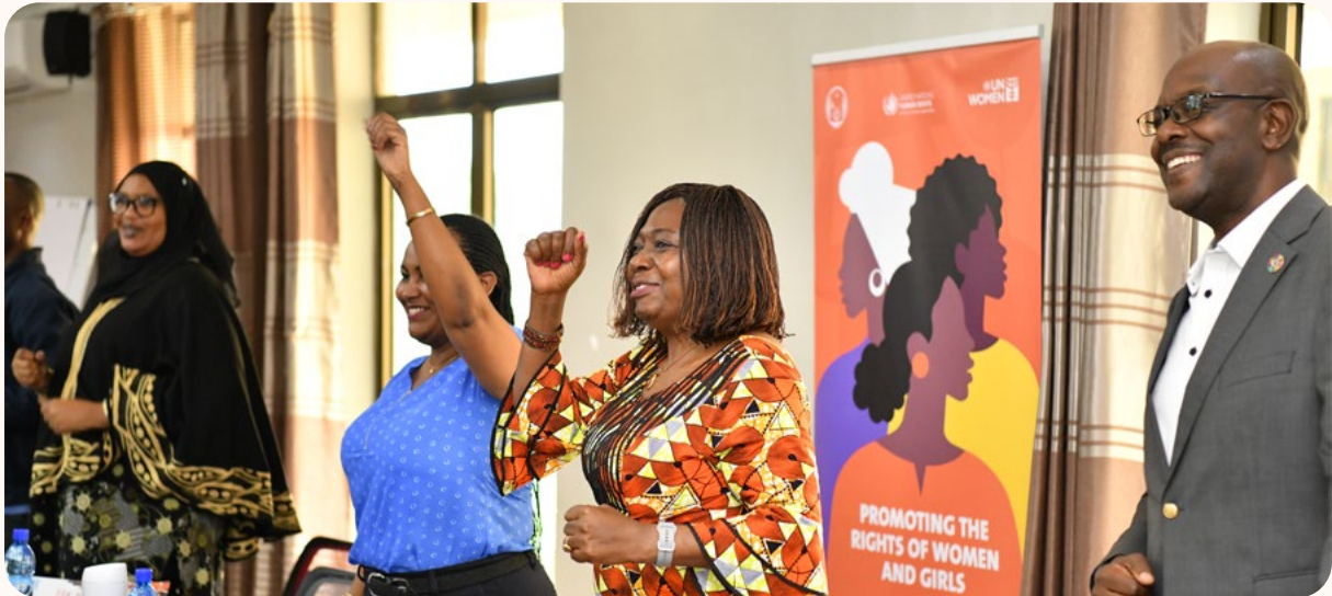
Multisectoral partners at the national CEDAW consultations.