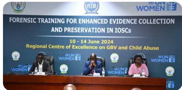
Participants at the forensic training.

In June 2024, UN Women and the Rwanda Investigation Bureau (RIB) successfully trained 54 nurses from over 45 hospitals hosting Isange One Stop Centres (IOSCs) across Rwanda. The training enhanced the nurses' skills in responding to GBV and child abuse cases, focusing on forensic examination, evidence collection and preservation, and physical assessment techniques . It also identified critical gaps in service delivery, including inadequate tools and infrastructure, and proposed actionable recommendations such as developing a forensic evidence manual and providing advanced equipment to improve IOSC services nationwide.