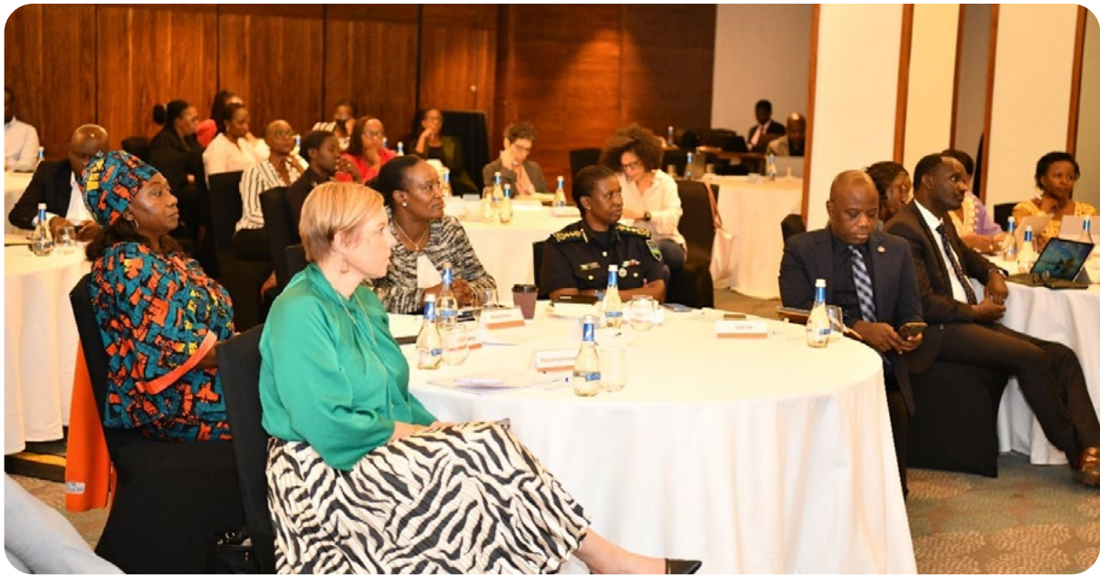
Hon. Minister Uwimana Consolee, Minister of Gender and Family Promotion delivering remarks.

Taking place on 10th December 2024, UN Women in partnership with the Ministry of Gender and Family Promotion, convened the “National Gender and Family Cluster” (NGFC) in an occasion to revitalize the multi-stakeholder platform for strengthened coordination of gender equality and family cohesion efforts. Established in 2010, The National Gender and Family Cluster (NGFC), brings together government, civil society, private sector, and development partners to align on the implementation of national and global gender equality commitments.