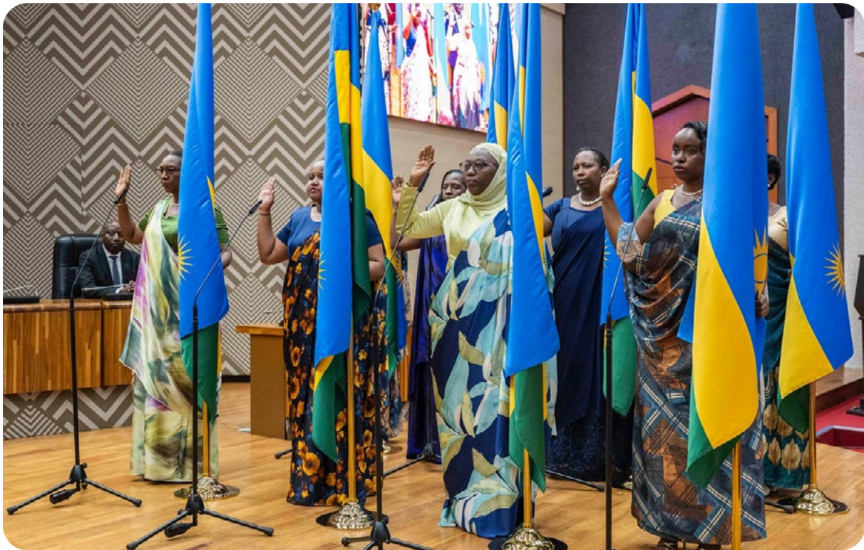
Some of the newly elected women members of the lower house during the swearing in ceremony.

In a remarkable stride towards gender equality, Rwanda has once again demonstrated its unwavering commitment to gender parity in its latest 2024 legislative election results. The percentage of women's representation in the Chamber of Deputies increased from 61.3 in 2018 to 63.8 per cent of seats in 2024. According to the Constitution, at least 30 per cent of the lawmakers in the lower house must be women. That means that the percentage quota allocated to women corresponds to 24 MPs as the Chamber of Deputies has a total of 80 members. Other special categories include youth and people living with disabilities and for the first time, people living with disabilities are represented by a woman.