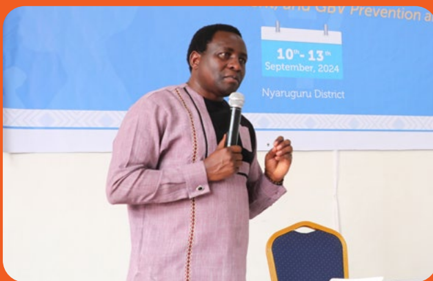
Mayor of Nyaruguru District delivering key remarks at the awareness raising event.

From September 10-13, 2024, UN Women, in partnership with Nyaruguru District, trained 100 teachers from primary, secondary, and TVET schools to address sexual harassment, GBV, and the impact of gender inequality on unpaid care work in schools. Through participatory sessions, the training enhanced teachers' understanding of gender concepts and mainstreaming strategies. Equipped with these skills, teachers are now better prepared to transform social norms, promote equitable parental practices, and foster men's engagement in advancing gender equality.