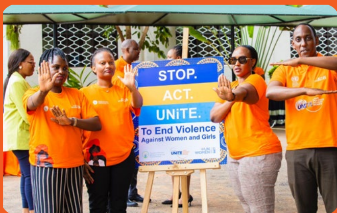
Stop.Act.Unite was the call to action as the UN came together to commemorate the 16 Days of Activism in Rwanda.

On December 8, 2024, a Car Free Day in Kigali was organized, featuring a public march and sports activities to raise awareness about GBV. On December 9, the UN family in Rwanda hosted an event to reflect on its role in supporting Rwanda’s efforts to end GBV, with calls for urgent action and unity in tackling the issue.