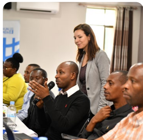
Participants of the Advancing Gender Equality in the Care Economy Workshop.

Commencing on the 26th of November 2024, UN Women in partnership with MIGEPROF, and the Government of Germany convened an extensive cohort of national partners from government, civil society, development agencies, academia and media, directly contributing to the care economy in Rwanda, for a weeklong workshop as a platform for renewed understanding, sharing of experiences and results, and strategizing to advance gender equality in the care economy for strengthened socio-economic development in Rwanda. The workshop explored various subject areas including policy frameworks, men engagement and community mobilization and their role in levelling the unequal burden of unpaid care work on women and girls. Ultimately, the workshop facilitated the creation of national priorities, actionable plans, and strategies to integrate the reduction and redistribution of unpaid care work into women's economic empowerment programs.