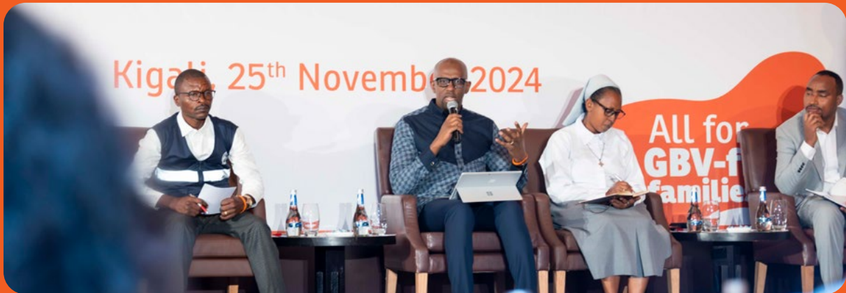
An engaging panel discussion at the 16 Days High-level dialogue in Rwanda shared key insights to prevent and respond to GBV within families and society at large.

The 16 Days of Activism was marked by various events hosted by UN Women, in collaboration with the Ministry of Gender and Family Promotion (MIGEPROF) and key stakeholders, to address gender-based violence (GBV) in Rwanda. The theme, “All for GBV-free families,” focused on family cohesion and collective responsibility in preventing GBV.