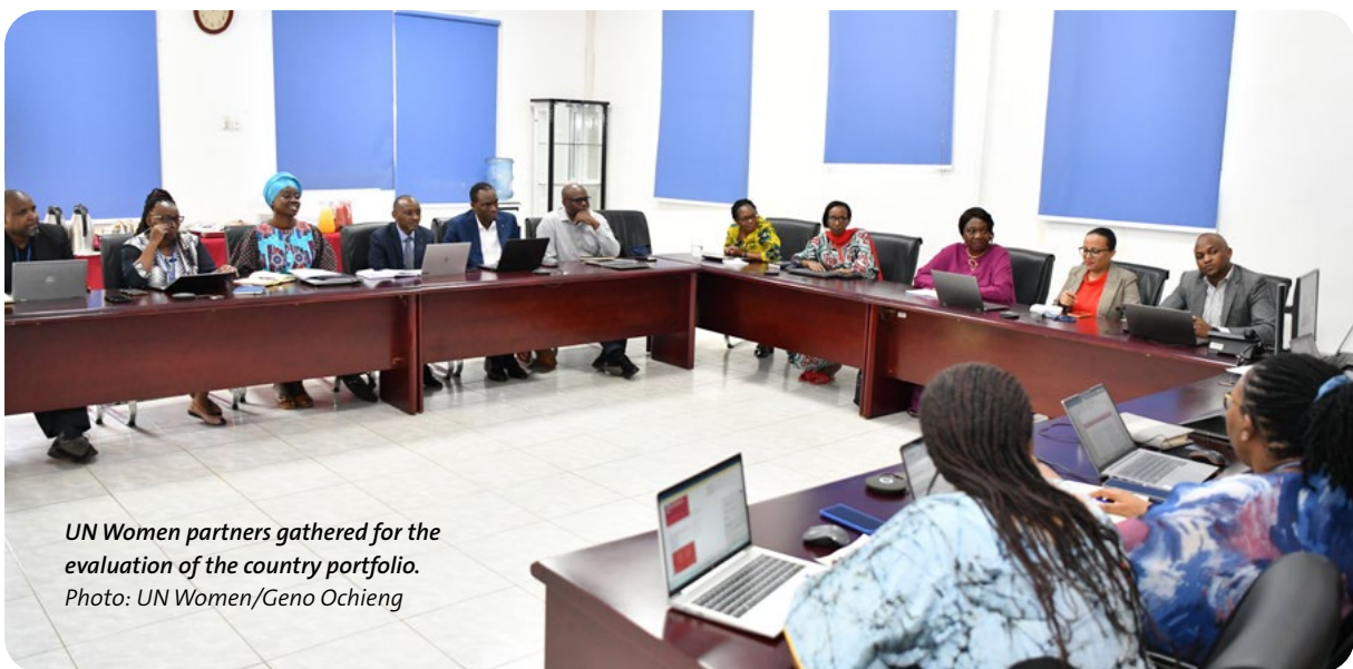
UN Women partners gathered for the evaluation of the country portfolio.