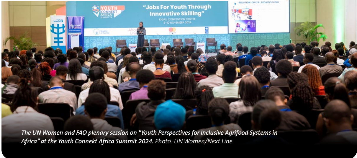
The UN Women and FAO plenary session on “Youth Perspectives for Inclusive Agrifood Systems in Africa” at the Youth Connekt Africa Summit 2024.

From November 8-11, 2024, Kigali hosted the 7th Youth Connekt Africa Summit, bringing together over 3,000 young people from across the continent under the theme “ Jobs for Youth Through Innovative Skilling. ” The event provided a dynamic platform to advance gender equality, youth empowerment, and innovation, fostering collaboration among key stakeholders across Africa.