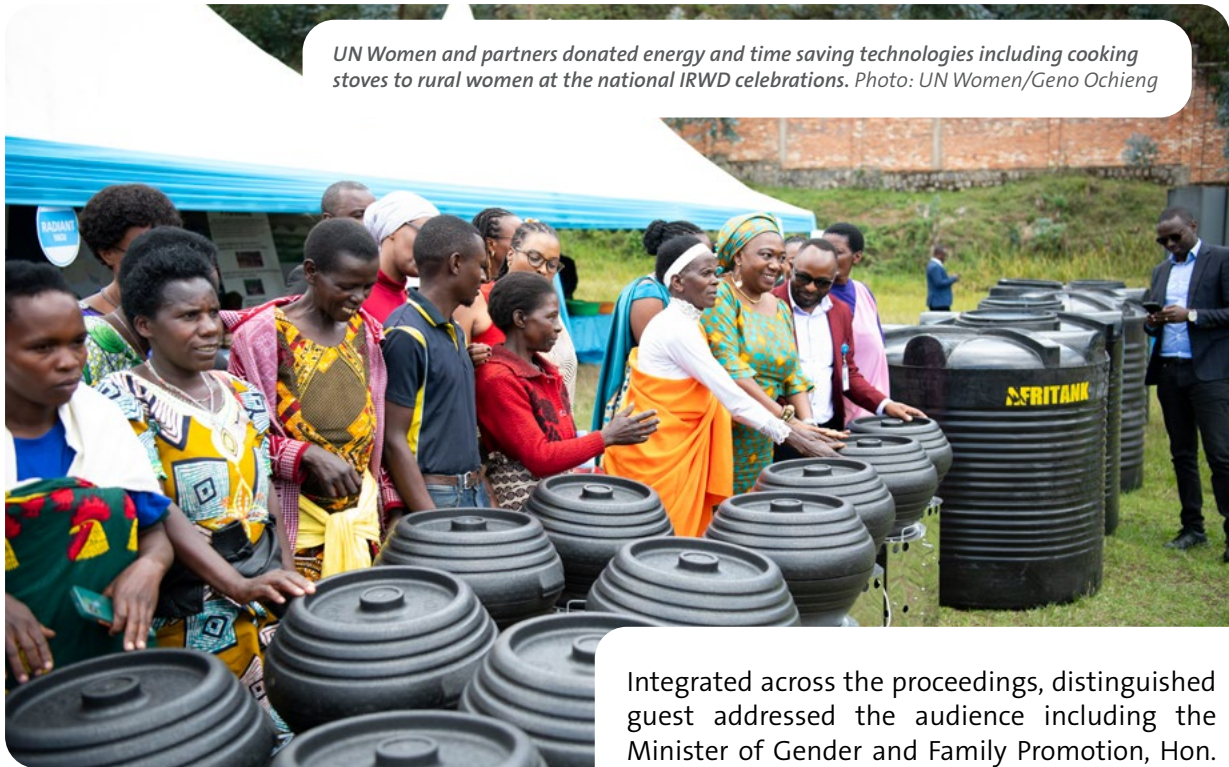
UN Women and partners donated energy and time saving technologies including cooking stoves to rural women at the national IRWD celebrations.

On the 15th of October 2024, the district of Nyamagabe convened in an elaborate occasion to celebrate the critical role of rural women in enhancing agricultural and rural development, improving nation-wide food security and nutrition, and eradicating poverty.