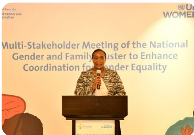
Hon. Minister Uwimana Consolee, Minister of Gender and Family Promotion delivering remarks.

Taking place on 10th December 2024, UN Women in partnership with the Ministry of Gender and Family Promotion, convened the “National Gender and Family Cluster” (NGFC) in an occasion to revitalize the multi-stakeholder platform for strengthened coordination of gender equality and family cohesion efforts. Established in 2010, The National Gender and Family Cluster (NGFC), brings together government, civil society, private sector, and development partners to align on the implementation of national and global gender equality commitments.