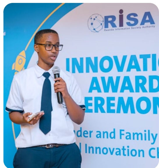
Members of the two winning teams of the Gender and Family Sector Digital Innovation Challenge.

Leveraging the potential of youth and technology to drive gender equality and sustainable development, UN Women in partnership with the Ministry of Gender and Family Promotion (MIGEPROF) and the Rwanda Information Society Authority (RISA) launched the nationwide Gender and Family Sector Digital Innovation Challenge. This initiative was developed to strengthen the participation of youth in developing actionable tech-based solutions to issues related to gender based violence, family cohesion and education. Spanning a period of three months, numerous innovations were critically evaluated with only six making it to the final awarding stage. Leading the competition, a team of young female students from the Rwanda Coding Academy, and a young female led startup known as Leins Tech were awarded the top prize of 5 million Rwandan Francs each to further develop their prototypes which were related to family cohesion and education.