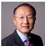
Jim Yong Kim President, World Bank Group