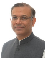
Jayant Sinha Minister of State for Finance, India