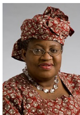
Ngozi Okonjo-Iweala former Minister of Finance, Nigeria