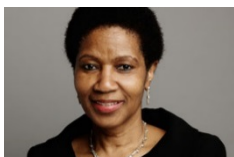
Phumzile Mlambo-Ngcuka United Nations Under-Secretary-General and Executive Director, UN Women