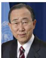
Ban Ki-moon Secretary General, United Nations