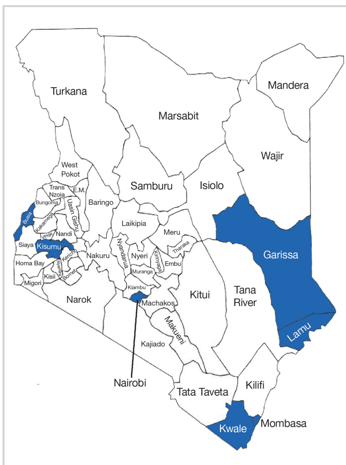
Figure 1: Counties in Kenya where the research was undertaken

communities, and sometimes even 'forced to relocate to avoid their children being labelled as a bad influence'. 25 It was reported that, owing to these kinds of tactics, women are afraid to report the disappearance of sons and husbands. 26