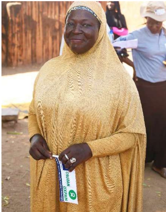
A happy #PROACT project partner in Adamawa State.

not received livelihood support. Even when I complain, they do away with my complaint, because I do not have any male figure in my life to help me fight for it. Women who have husbands get more aid than single women.”— Key informant interview with female household head in an IDP camp, Borno State