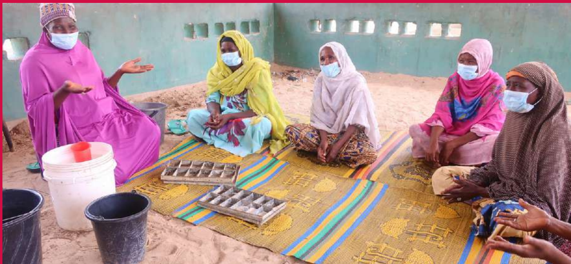
Through the income-generating activity training, local women at El-Miskin Centre Camp are empowered to be financially independent.