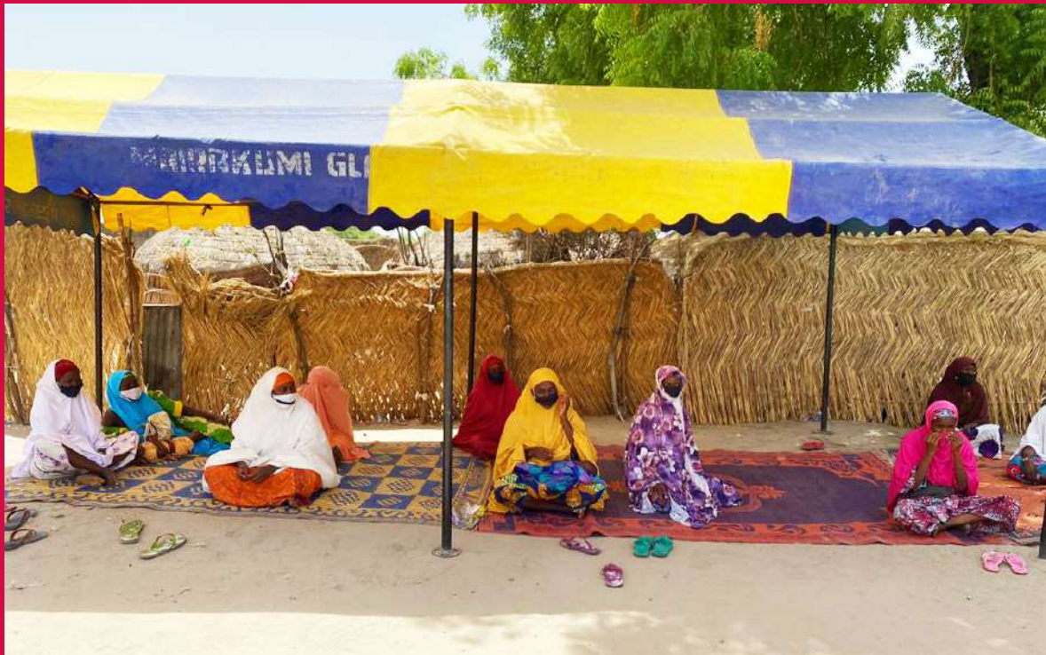
Conditional cash transfer in Nguru, with participants adhering to physical distancing in line with government measures towards the prevention of COVID-19.