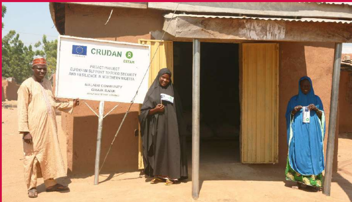
Over the years of the #PROACT project implementation, there has been an increase in women's participation in local leadership positions. Women have been represented in various committees formed in their respective communities as they collaborate to mitigate the effect of food insecurity, which is prevalent in northern Nigeria. This is a grain bank committee in Malabu community in Adamawa State.