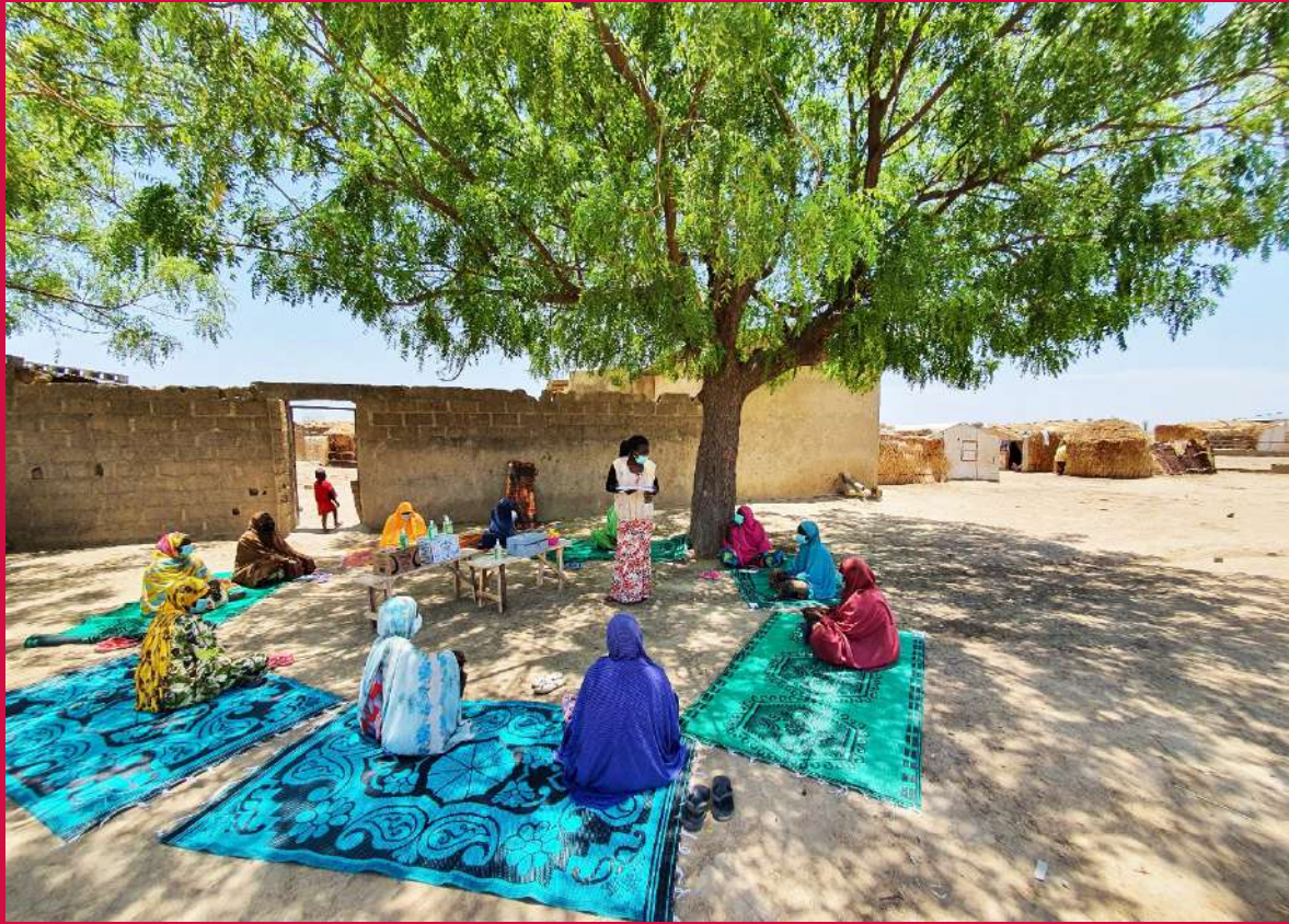
Training of Village Savings and Loan Association members in Dikwa community in Borno State on 14 May 2020.