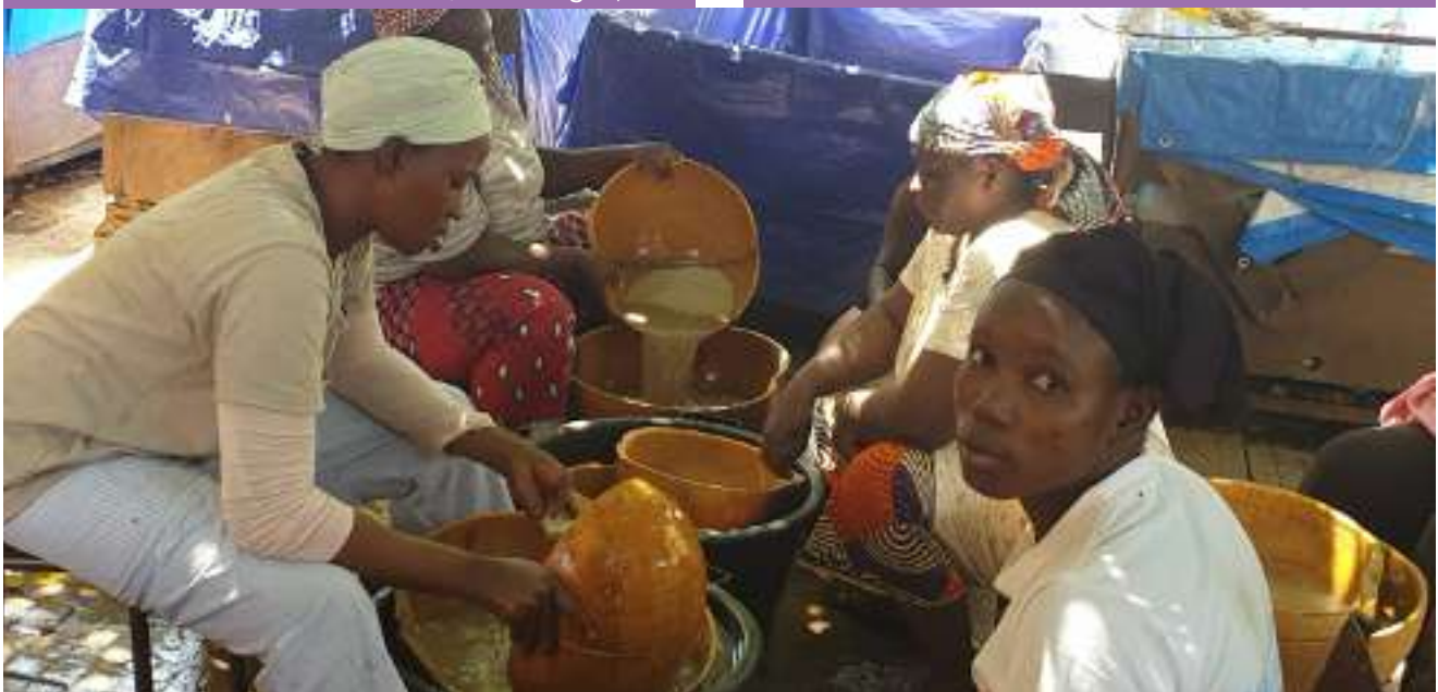
UN WOMEN Mali/SJM Mongbo, 2019