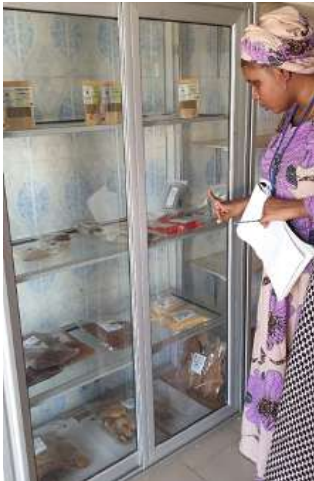
UN WOMEN Mali/SJM Mongbo, 2019