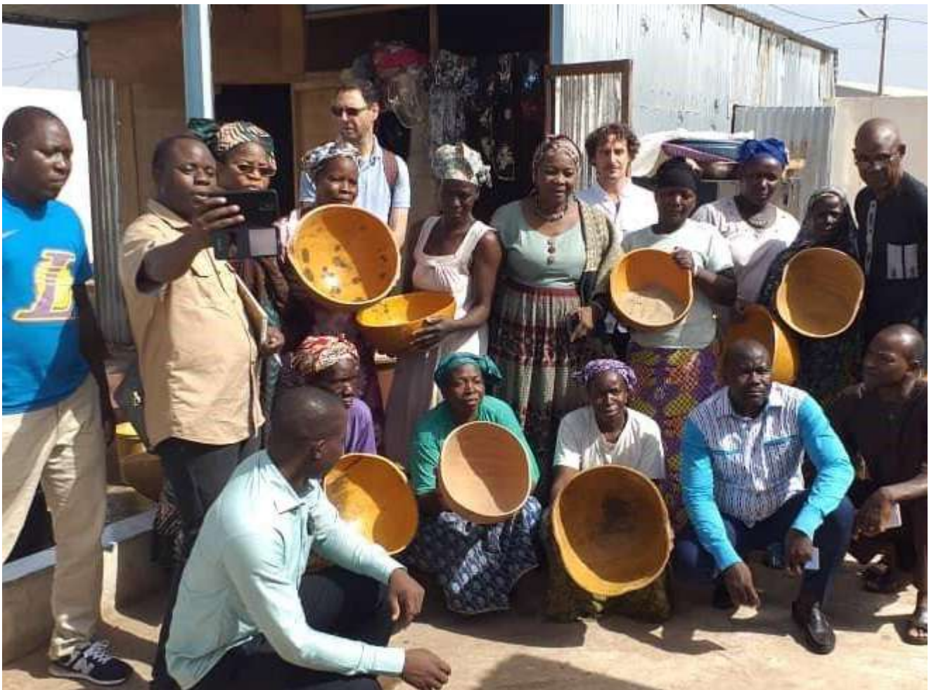
Sirébara, Helvetas Mali-Burkina-Benin visiting the activities

She identified the need for a solar steaming technology to seize the market demands which is beyond the current productivity level.