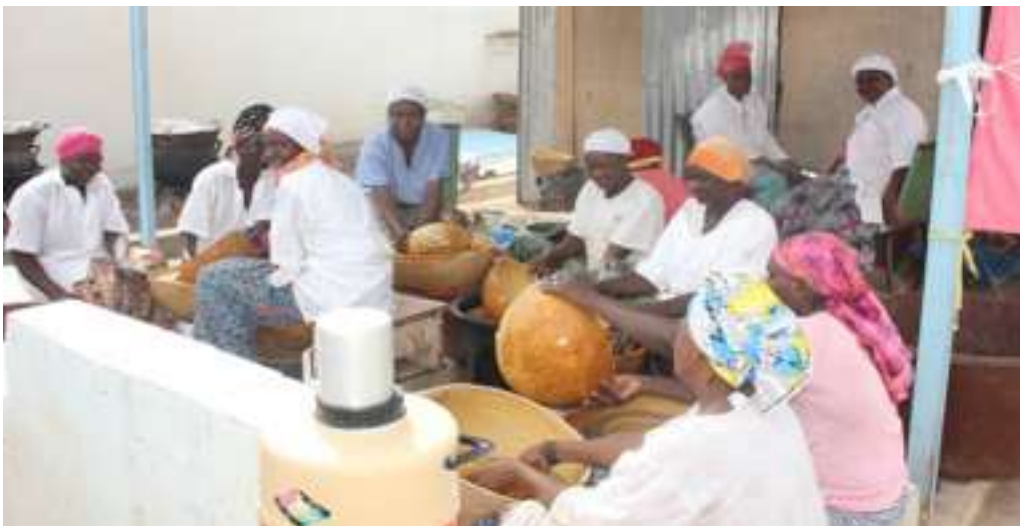
Rural Women Training Center/ Sirébara, Training in Fonio Processing, 2017