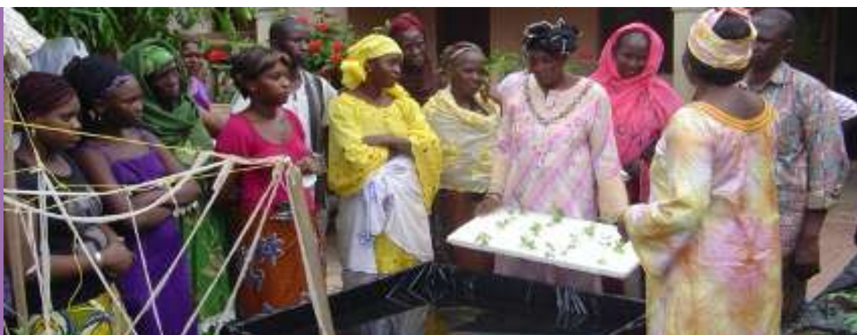
Rural Women Training Center/Sirébara, Demonstration in Hydroponic Gardening, 2017

of Organic Agriculture in India in 2017, following a world competition that took 2 years. I am particularly proud of this accomplishment. I train a core team of trainers in all my fields of activities. I employ these trainers in the Center for Rural Women that I run. My biological and adoptive children are members of the core team. International NGOs also now recruit me to train trainers and starters in my field of activities. I will be on a business trip to Burundi to train the youth on behalf of IFAD, in January 2020."