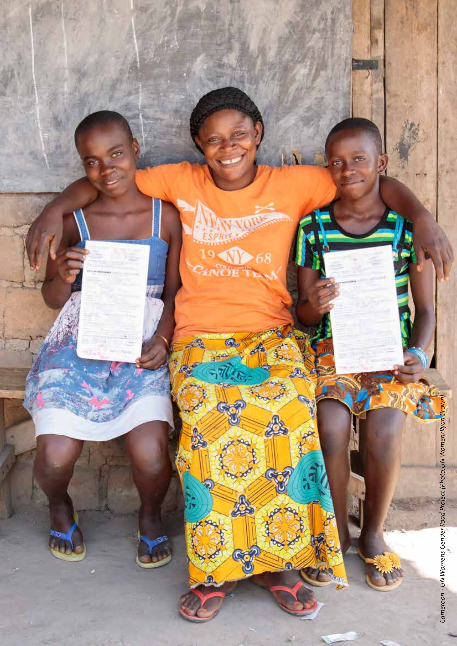
Cameroon - UN Womens Gender Road Project